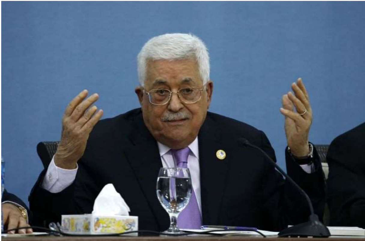
Palestinian President Mahmoud Abbas speaks during a meeting with journalists in the Palestinian Authority headquarters in Ramallah on July 3, 2019.