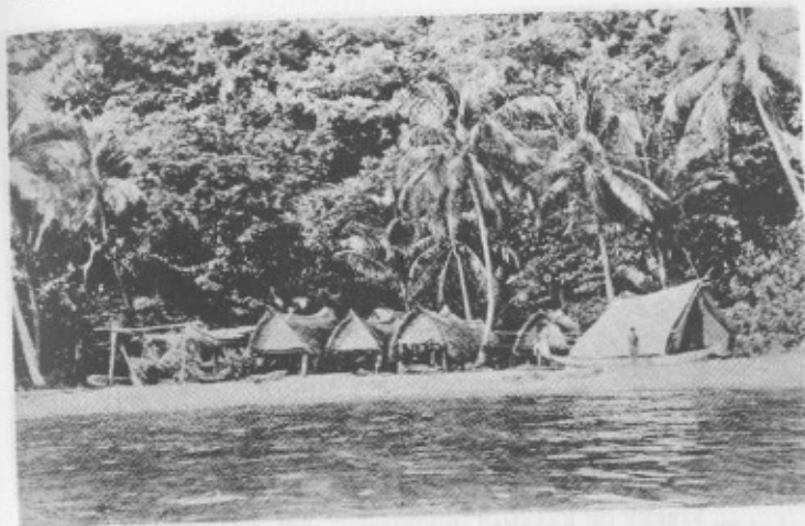
THE ETHNOGRAPHER'S TENT ON THE BEACH OF NU'AGASI

This illustrates the manner of life among the natives, described on p. 6. Note (with reference to Chs. IV and V) the dug-out log of a large canoe beside the tent, and the masawa canoe, beached under palm leaves to the left