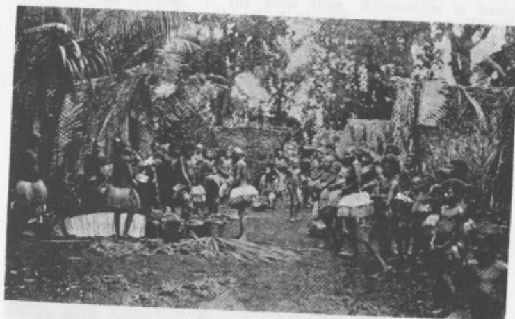
SCENE IN YOURAWOTU (TROBRIANDS)

An everyday scene, showing groups of people at their ordinary occupations. (See p. 7.)