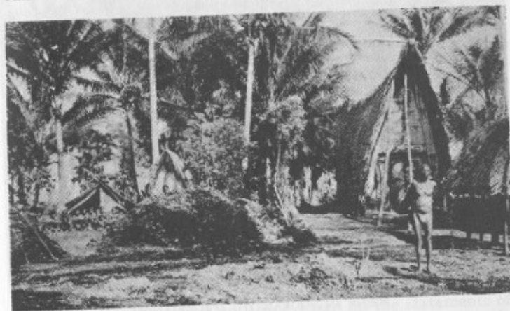
THE CHIEF'S LISIGA (PERSONAL HUT) IN OMARAKANA