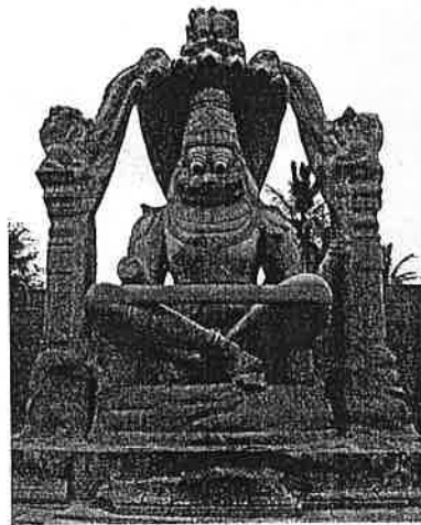
Ugranarasimha at Hampi

Lotus Mahal: Shaped like a lotus flower when viewed from the top, this two-storey structure has beautiful archways set in geometric regularity. It was an air-cooled summer palace of the queen.