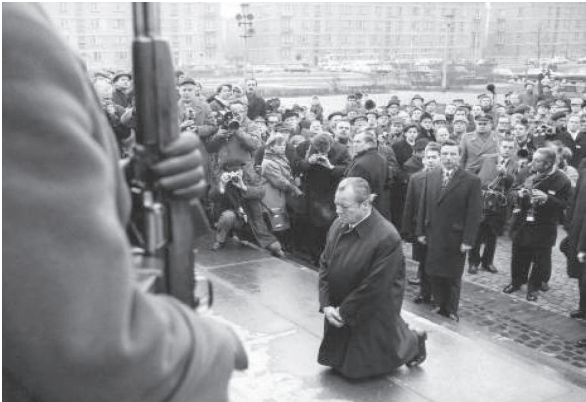
Figure 8.1 Willy Brandt kneeling in front of the Ghetto Memorial

classical theatre (Eco 1977). In contrast, television genres such as news reports or “reality TV” represent a wider scope of social reality. Here, the mediated person simultaneously refers to him- or herself both as a “real person” and to his or her social role. On television news reports he or she walks and talks not like a politician, but as a politician (Eco 1977). If, for instance, the kneeling German Chancellor is broadcasted on TV, it shows not only an actor who plays or imitates political ceremony, but someone who creates as the “real” Chancellor a new reality of commemoration by a performative act. Television’s means of symbolic productions produce a multifaceted spectrum of social realities; the newer medium innovates and iterates theatre at the same time. Seen from the perspective of speech-act theory, this means that television enables real politicians to perform an act in order to transform the status or identity of the collective that they represent. In (post)modern societies teatro mundi is challenged by media mundi .