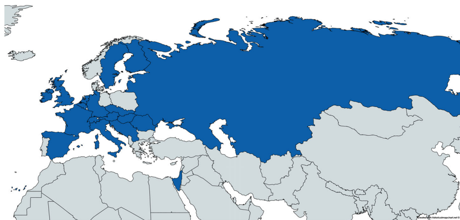
FIGURE 4 National membership of the EPS, as represented by the official national bodies that signed the constitution on September 26, 1968. This map has been realized using historicalmapchart.net ( https://historicalmapchart.net/world-cold-war.html ), retrieved June 20, 2018 (CC BY-SA 4.0). National borders in historical periods were, of course, a matter of political controversy and diplomatic negotiations. This is certainly the case for the identification of the Sinai region as part of the Israeli state after the Six-Day War. The author does not intend to make, or share, any claim concerning the geopolitical description conveyed by the tool employed. This is simply a representation of the membership of the EPS in 1968 [Color figure can be viewed at wileyonlinelibrary.com ]

the EPS. 112 Whatever position they expressed during the discussion, everyone agreed that, in this more strategic sense, founding the society was itself a political act. Even though some protested, the final decision was to found the society as planned, with only a weak mention of the ongoing political situation in the letter of invitation to scientific institutions.