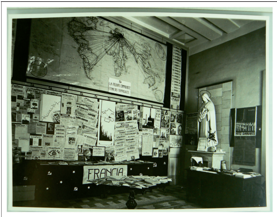
Figure 4. The exhibition room dedicated to France is dominated by a statue of the Virgin Mary to the right (representing the Vatican) and a map of the world (upper left). The sign on the map reads, ‘La pieuvre communiste étend ses tentacules’ (The communist octopus spreads its tentacles). Moscow is the black dot/octopus irradiating communist propaganda worldwide.

communist Associations). Of course, it was no secret that the Gesamtverband was in fact a creature of Joseph Goebbels’s Ministry of Propaganda and Popular Enlightenment. 57 Entitled ‘Bolschewismus ohne Maske’ (Bolshevism Unmasked), the exhibition sought to reveal the ‘true face’ of international communism (Figure 6). Though the Gesamtverband exhibition was much-admired by the Italian and German media, a somewhat more skeptical reporter for the Catholic newspaper Avvenire d’Italia noted that it was ‘much more cumbersome’, than the Vatican equivalent, despite its evident debt to the Secretariat’s ‘scholarly and universal touch’. Father Ledóchowski ‘did not hide his satisfaction’ upon reading this article and learning of the positive response to Ledit’s Munich trip, which in his view