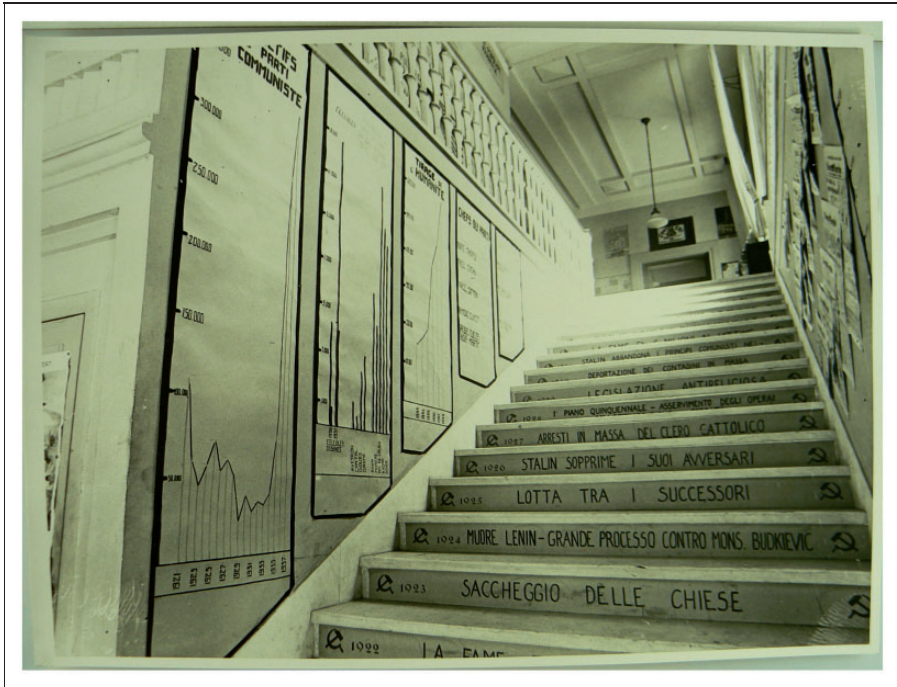
Figure 2. The central stairway of the 1938 exhibition graphically represented Soviet religious persecution.