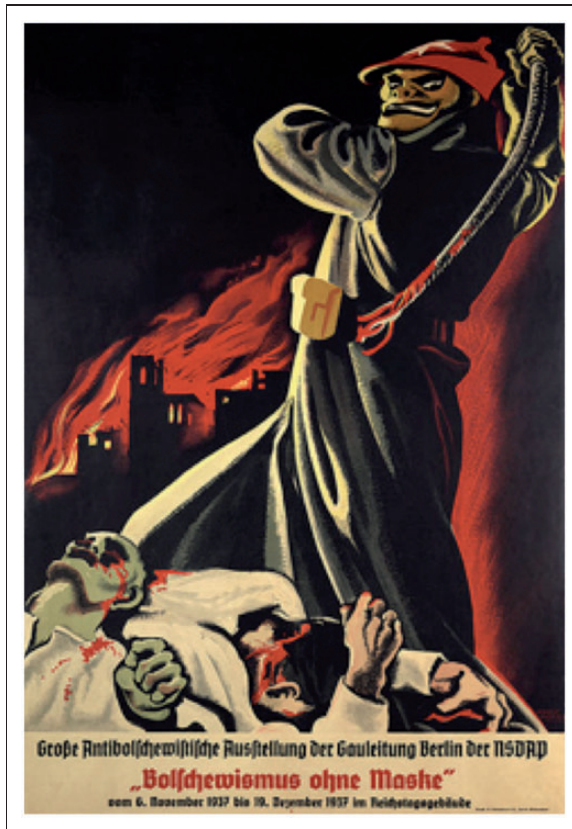
Figure 6. Propaganda poster for the Berlin edition of the Gesamtverband exhibition, 'Bolschewismus ohne Maske', held from 6 November through 19 December 1937. Despite the Gesamtverband's claims to independence, the poster presents the exhibition as an NSDAP affair. Source: Bolschewismus ohne Maske, 1937.

Radio, which by now broadcast its signal across Europe and the Americas, the Secretariat could ever more confidently claim leadership of a campaign waged through new media across national borders. 61