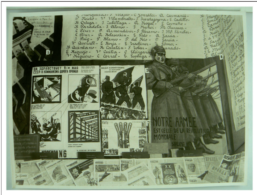
Figure 3. Unmasking Soviet violence at the 1938 exhibition. The handwritten caption reads, ‘Our army is the army of the world revolution – Stalin’.

that in addition to bringing the 1936 show on the road, the Secretariat would host two additional such exhibitions in 1938 and in 1939. 56