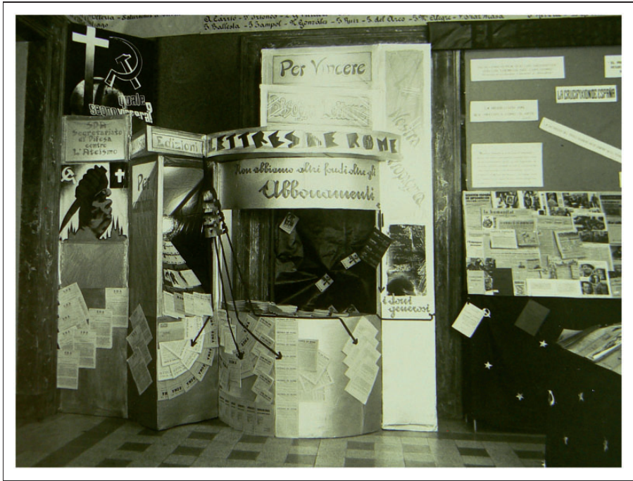
Figure 5. The kiosk in the final exhibition room sold copies of Lettres de Rome and other Vatican anti-communist literature, and was framed by the statement, ‘Per Vincere, Bisogna Lottare’ (To win, you must fight). The classic in hoc signo vinces poster can also be seen on the wall, in the upper left-hand corner.