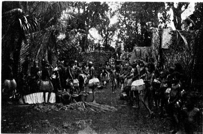
SCENE IN YOURAWOTU (TROBRIANDS)

A complex, but well-defined, act of a sagali (ceremonial distribution) is going on. There is a definite system of sociological, economic and ceremonial principles at the bottom of the apparently confused proceedings. (See Divs. IV and V.)