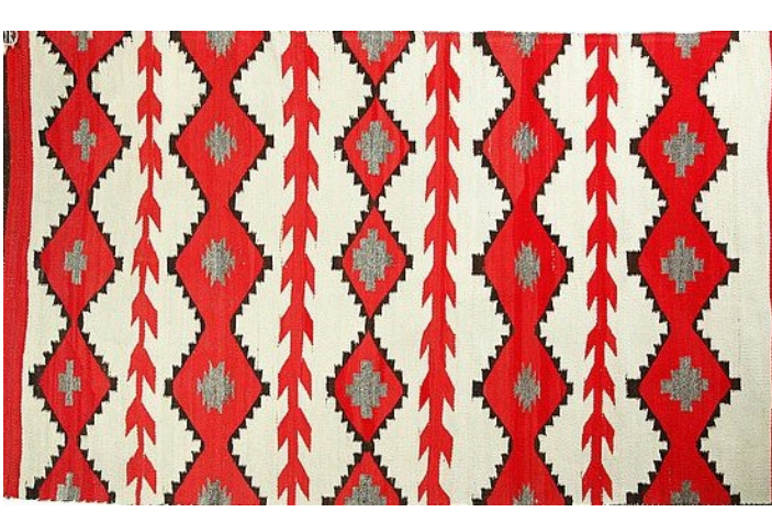
Navajo rug – a symbolic pattern using number 4 – balance, stasis, and 3 – imbalance, momentum