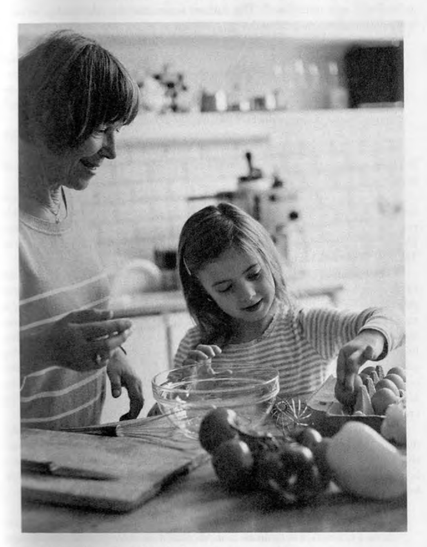
Figure 6.2 Grandma with child in kitchen

as 'progressive'. This is more commonly known as 'pinkwashing' and the authors argue that it is a manifestation of homonationalism, which positions the equitable treatment of LGBT+ individuals as a key icon of civilisation and social progress. Other societies that do not meet this standard are conversely constructed