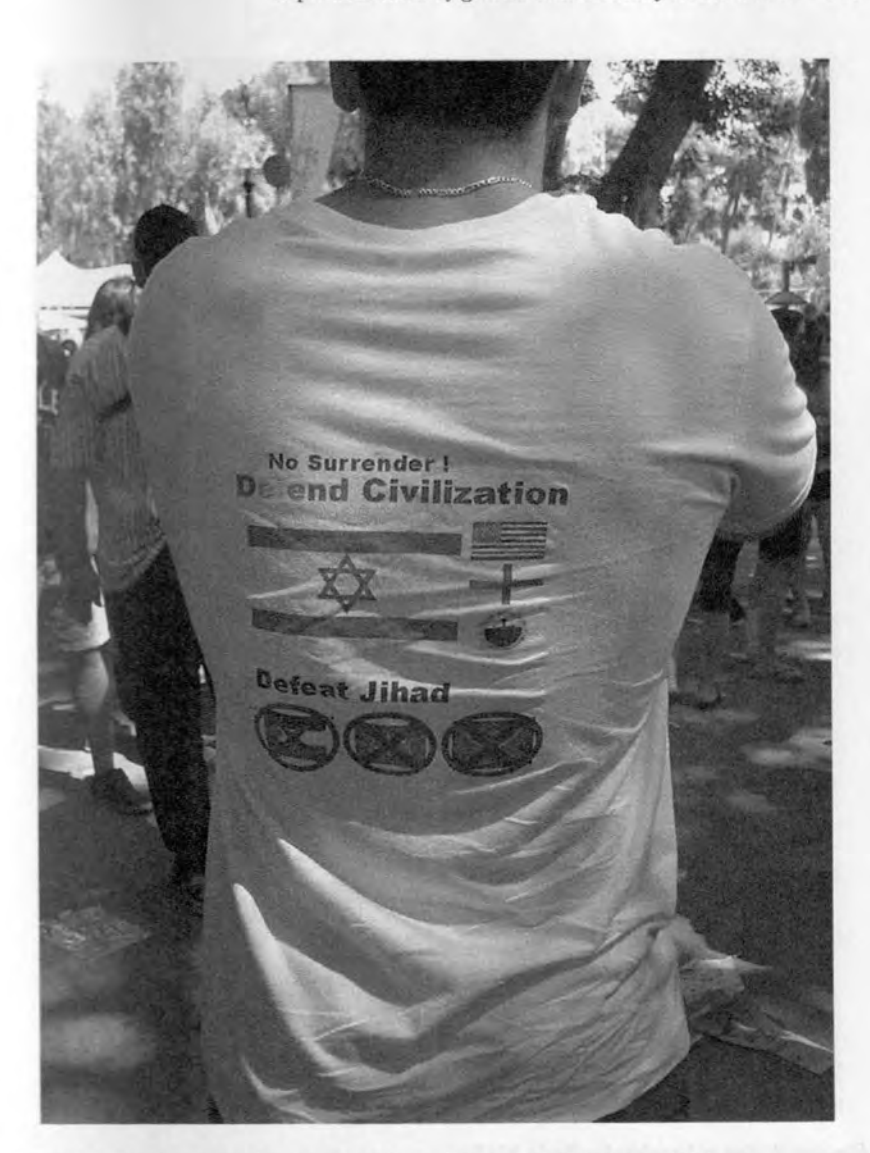
Figure 6.3 Ready-to-wear homonationalist politics - Tel Aviv Pride 2013

materials for Tel Aviv which the authors found to be publicly visible at Stockholm Pride. Another example of promotional material is included in Figure 6.5.