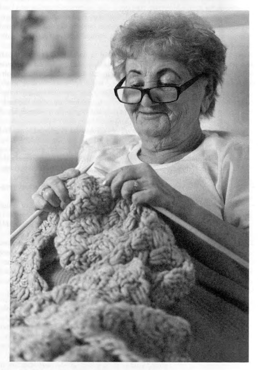
Figure 6.1 Grandma knitting