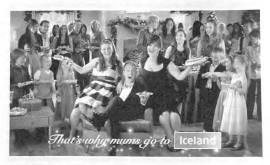
Figure 4.1 Iceland advertisement

In the Iceland advert noted earlier, one of the main ideologies being conveyed in this text is concerned with gendered relations of power. It is only 'mums' who go to Iceland, because 'mums' (i.e. women) have primary responsibility for domestic duties, such as grocery shopping. There is no mention of 'dads' going to Iceland. So this ideology clearly places women in the domestic sphere and assigns an identity to them which is primarily centred on raising and caring for children and looking after the home. This, of course, is not a true reflection of society. It constructs a very partial (and actually very oldfashioned) view of gender relations within heterosexual familial contexts. Despite the fact that many women have jobs and careers, the women in these texts are not represented in those domains - they are restricted to the domestic domain (home, garden, supermarket, etc.). Although gender ideologies are perhaps the most obvious ones which are conveyed in this text, there are also other ideologies in operation. I have yet to see an Iceland advert in which the actors are not white. They are always able-bodied, and the more recent adverts have featured wealthy female celebrities. So what we have is a partial representation