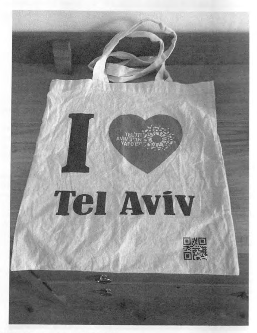
Figure 6.4 Bag at Stockholm Pride 2015

text. Milani and Levon note that, in this text, as in others analysed in the same project, there are images of men who are young, slim, muscled or in drag. There are no women in the marketing materials promoting Tel Aviv and restrictive representations of men dominate the promotional landscape of the city. Hence, the LL analysis works to reveal restrictive discourses not only of gender and sexuality but also of nationalism in the context under scrutiny.