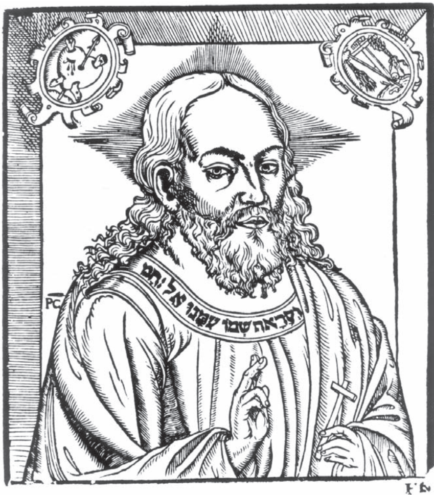
Illustration 1. Single-Leaf Print by Heinrich Königwieser (Wittenberg, ca. 1560). Coburg, Kunstsammlungen der Veste Coburg (I, 435, 1). From Walter L. Strauss. The German Single-Leaf Woodcut, 1550–1600 . 3 Vols. (New York, 1975), 2:529.