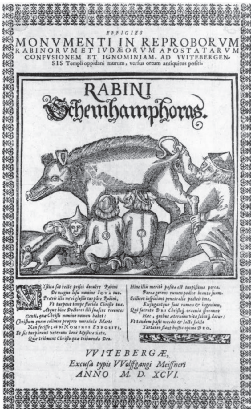
Illustration 2. Single-Leaf Print by Wolfgang Meissner (Wittenberg, 1596). Bamberg, Staatsbibliothek: VI G 203.