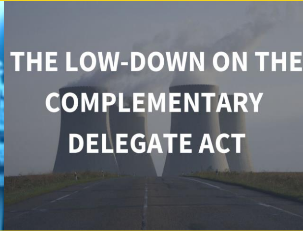
Complementary delegated act