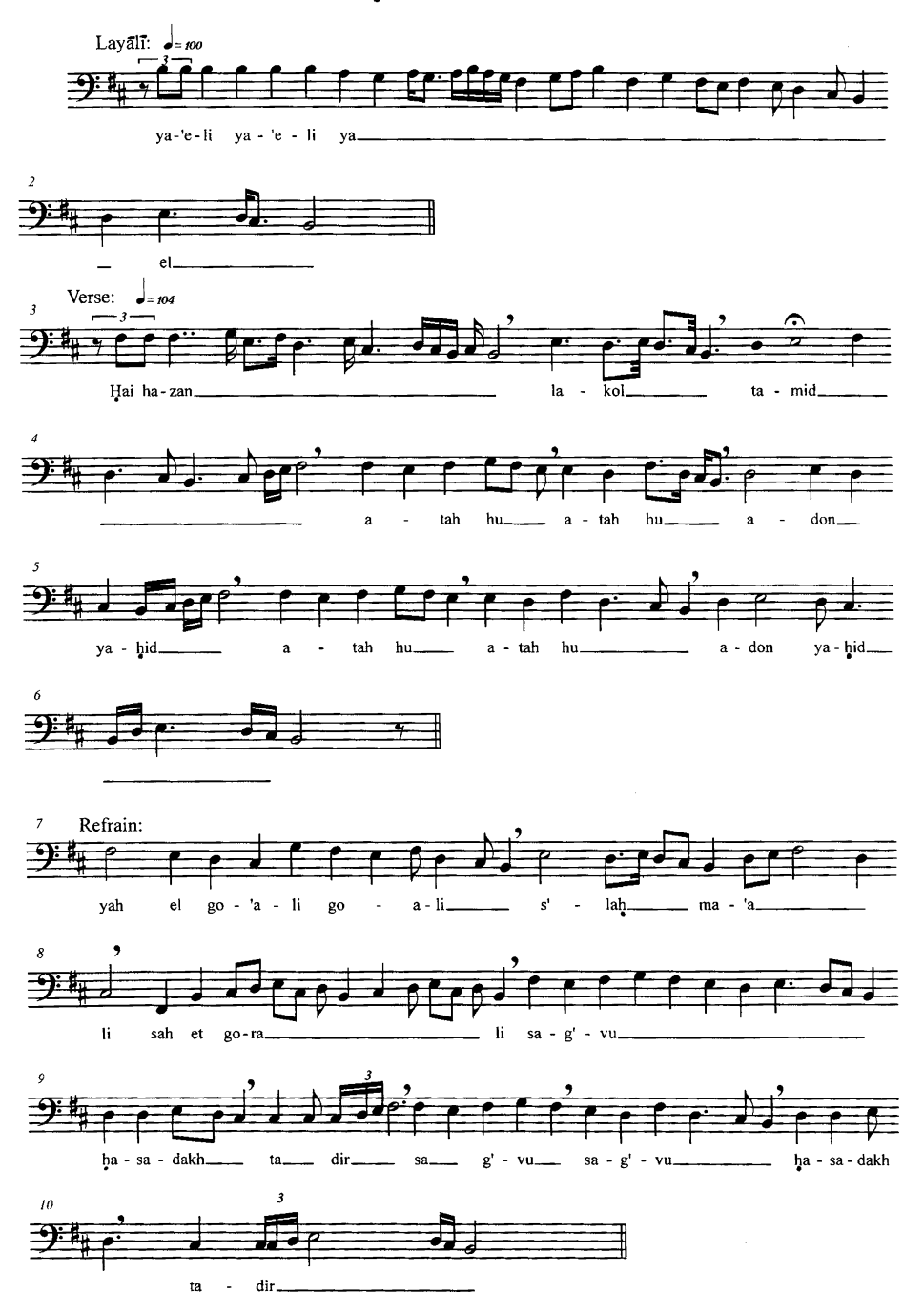
Figure 2 Partial Transcription of Pizmon Hai Hazan. Performance recorded on 13 November 1984, Brooklyn, New York, with Moses Tawil, Isaac Cabasso and Ensemble.