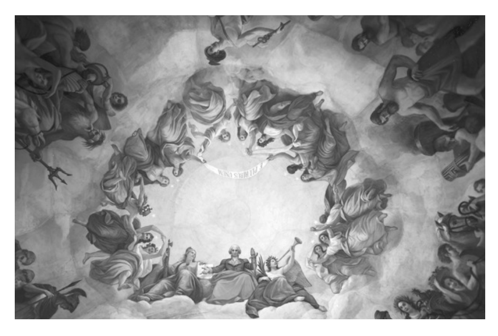
Constantino Brumidi's fresco, "Apotheosis of George Washington," in the Rotunda of the U.S. Capitol building