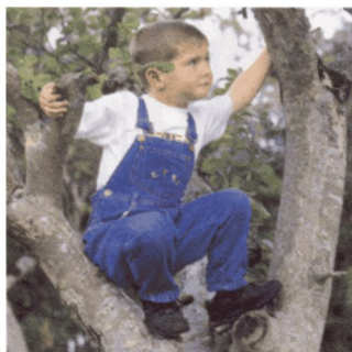
He was able to climb up the tree.

Can is used in the present and future. Could is the past tense of can . We use be able to to form all the other tenses.