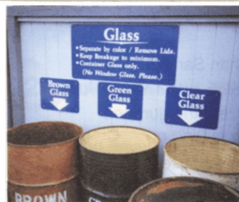
Everyone should recycle their rubbish.

We use must to refer to the present or future.