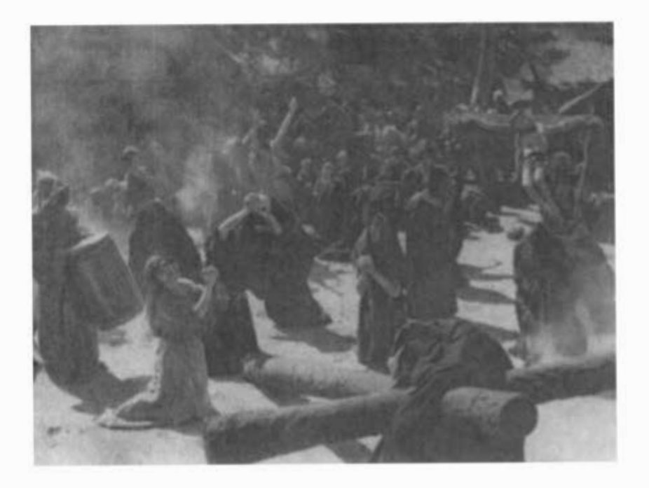
The famously emotive Flagellant sequence from The Seventh Seal. The image of the crucified Christ in the upper right is the same one that we see in an earlier scene of Antonius Block's confession to Death.

This brings us back to our original question: Does Bergman sufficiently balance his medieval and modern approaches to faith? I believe that, when all is said and done, he does not. The Seventh Seal is altogether too dark, too pessimistic a film to adequately convey how late medieval society was able to overcome the Black Death, and thus make the transition to the modern world. Bergman himself confessed in his film memoirs that "what attracted me [to The Seventh Seal] was the whole idea of people traveling through the downfall of civilization and culture." Shortly after its release, some reviewers picked up on the film's overwhelming darkness. John Russell Taylor, for instance, judged it a failure because "it never finally convinces us, as it obviously intends to, that all its horrors, the rapes, tortures, flagellations, burnings, are valid expressions of a pessimistic world picture only lightly touched with hope." One comes away from The Seventh Seal more powerfully impressed by images that show a "waning" civilization, as opposed to the lighter scenes that point to late medieval culture's recovery and renewal. Albertus Pictor's prophecy that people are more fascinated by a