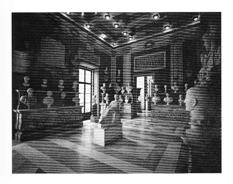
FIGURE 1-6. View of the Stanza degli Imperatori, Palazzo Nuovo, Musei Capitolini, Rome

Following the Stanza de' Filosofi is perhaps the most recognizable room in the museum, the Stanza degli Imperatori (fig. 1-6), or, as Gaddi termed it, the Stanza della Serie Imperiale, known for its series of busts of the Roman emperors and their family members arranged in chronological order on two tiers of marble shelving. Gaddi characterized the shelves in this room, with foliate decoration, as more "signorili" (aristocratic) than the simpler shelves in the