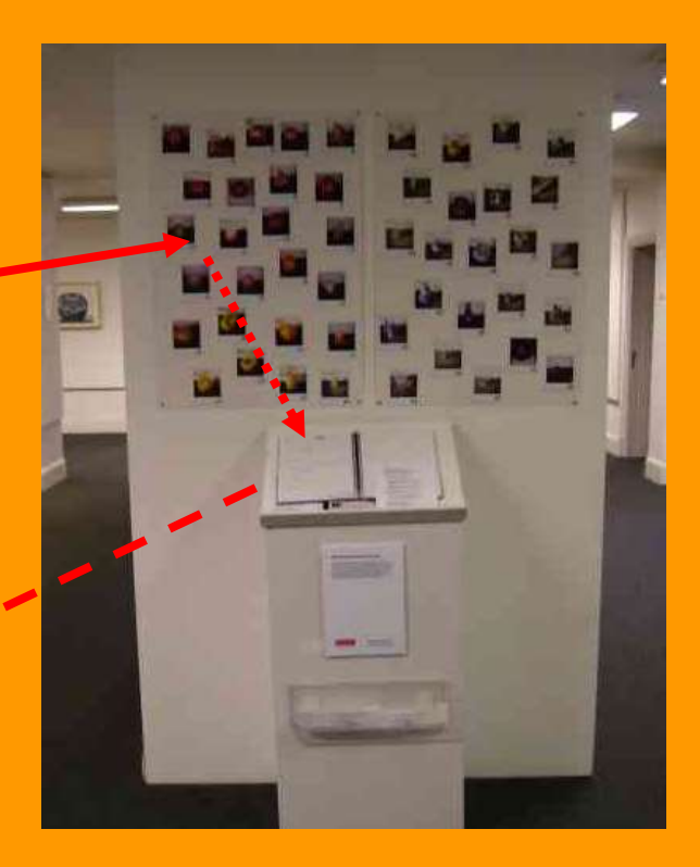
community decision board