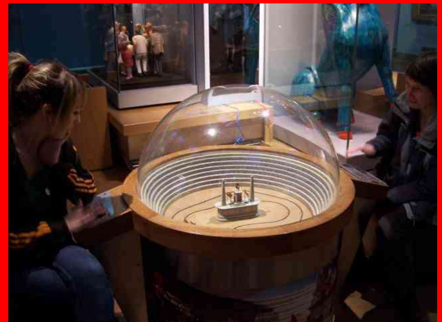
Manchester Art Gallery, 2007