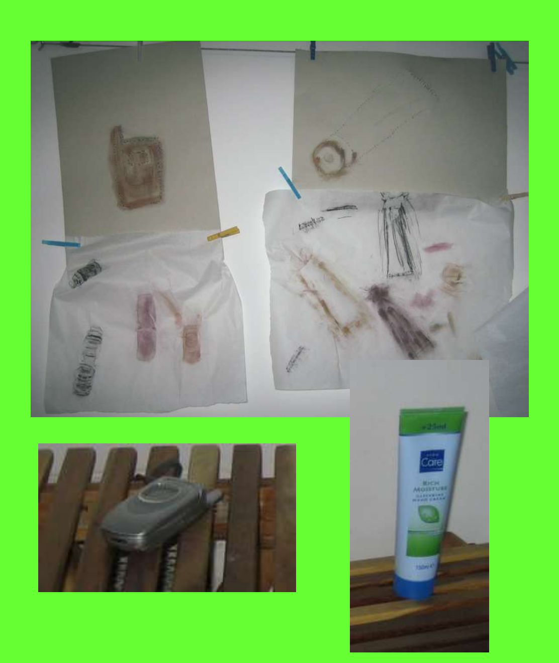
National Gallery Prague, 2006