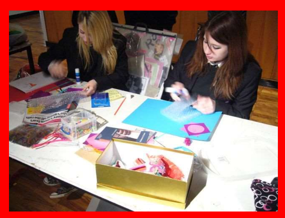
Whitworth Art Gallery Manchester, 2007