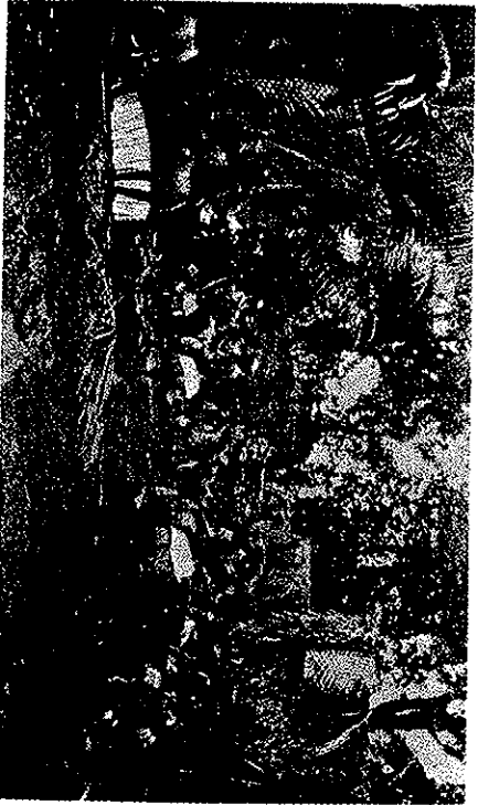
SCENE IN YOURAWOTU (TROBRIANDS) A complex, but well-defined, act of a ragili (ceremonial distribution) is going on. There is a definite system of sociological, economic and ceremonial principles at the bottom of the apparently confused proceedings. (See p. 8.)