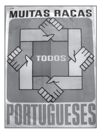
Illustration 1. Muitas raças, Todos portugueses ("Many races, all Portuguese") – one of the propaganda posters collected between 1969 and 1971, preserved and digitalized by Fernando Hipólito, a Portuguese veteran of the war in Angola.<sup>48</sup>

Portuguesas) during the ongoing national liberation wars in Luso-Africa, two examples of these are provided below. The first one (Illustration 1), entitled Muitas raças, Todos portugueses ("Many races, all Portuguese") fits in with the image of the Portuguese colonialism devoid of racism. While the second (Illustration 2) Povo português é povo africano ("Portuguese people are African people") reflects the unity of the Portuguese and Africans. The figures on the poster embracing each other can symbolize the friendship between them and the "natural" presence of the Portuguese on the African continent.