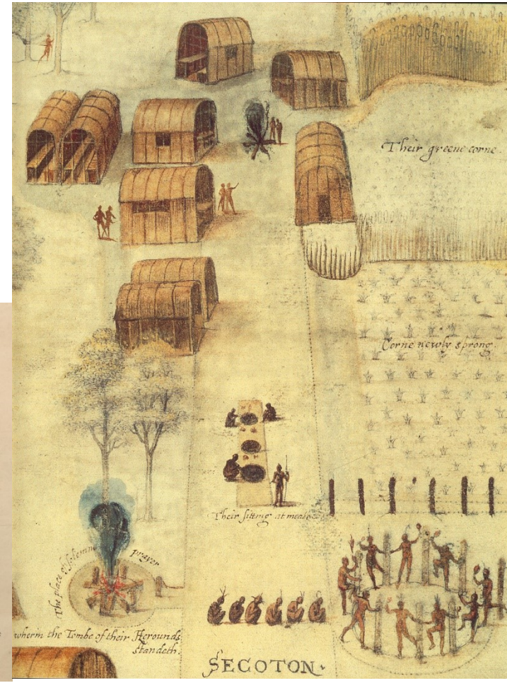
White's drawing of a Secotan village: buildings, agriculture, eating habits, religion