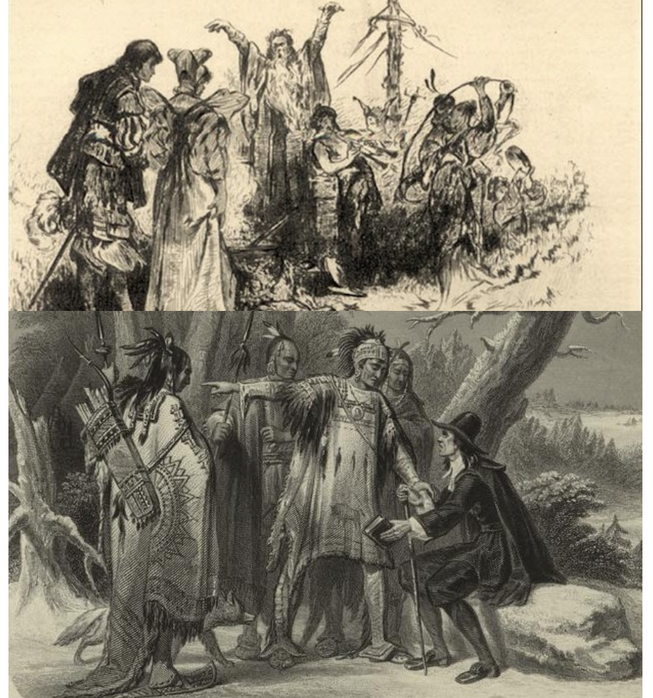
Above: Consecration of the Lord and Lady of May at Merrymount

The first account of Native American languages in English based on the author’s interaction with the Narragansett and Wampanoag tribes . After his expulsion from the Puritan Massachusetts Bay colony, Williams founded Providence Plantations (1636) - nowadays’ the state of Rhode Island, which became the place of religious tolerance.