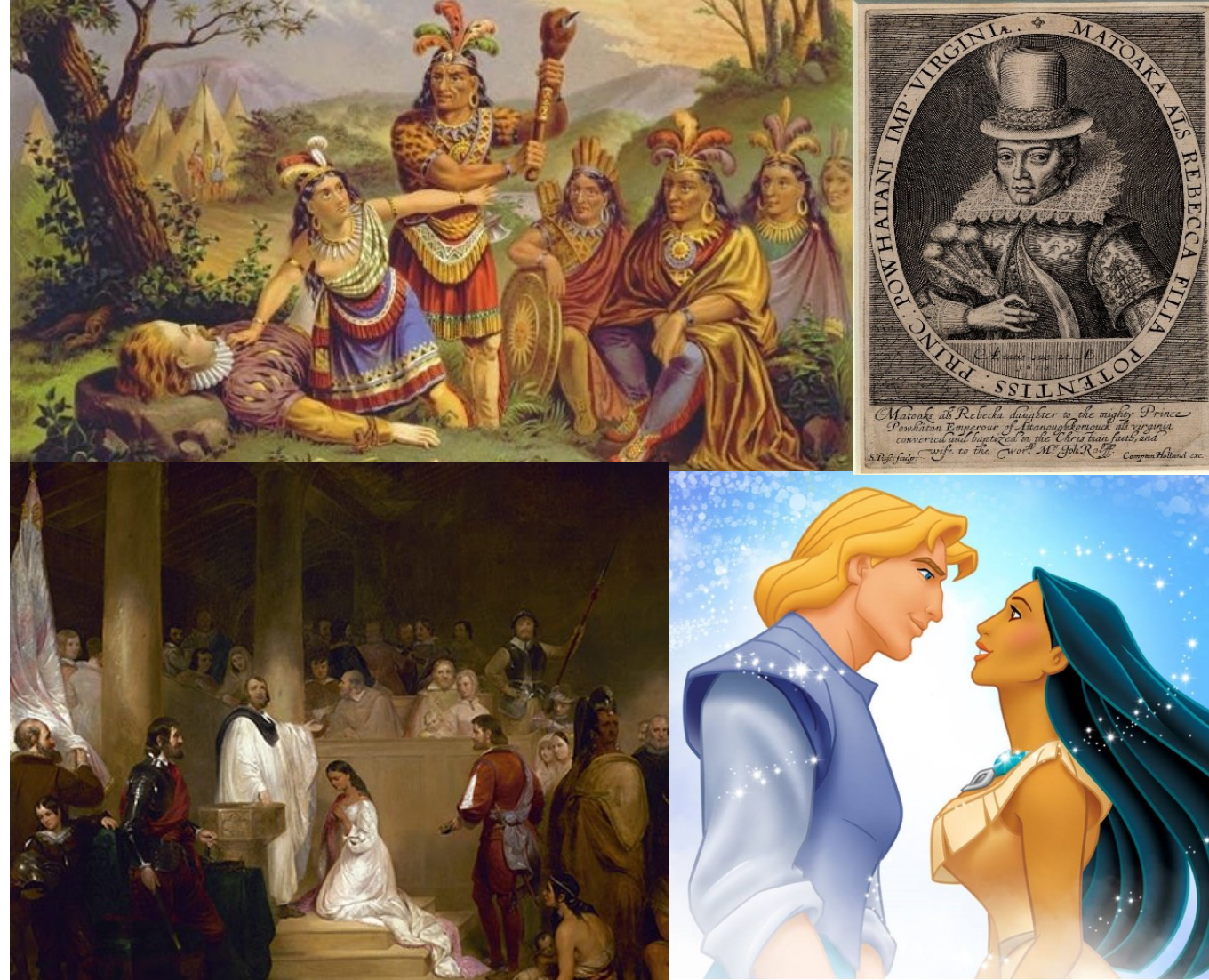
Above: rescuing John Smith; Pocahontas in England. Below: Pocahontas' baptism; Disney movie

Pocahontas thus becomes not only a personification of (non-existent) Indian submissiveness , but also of the fertility of the land, and of divine mercy bestowed on the colonizers .