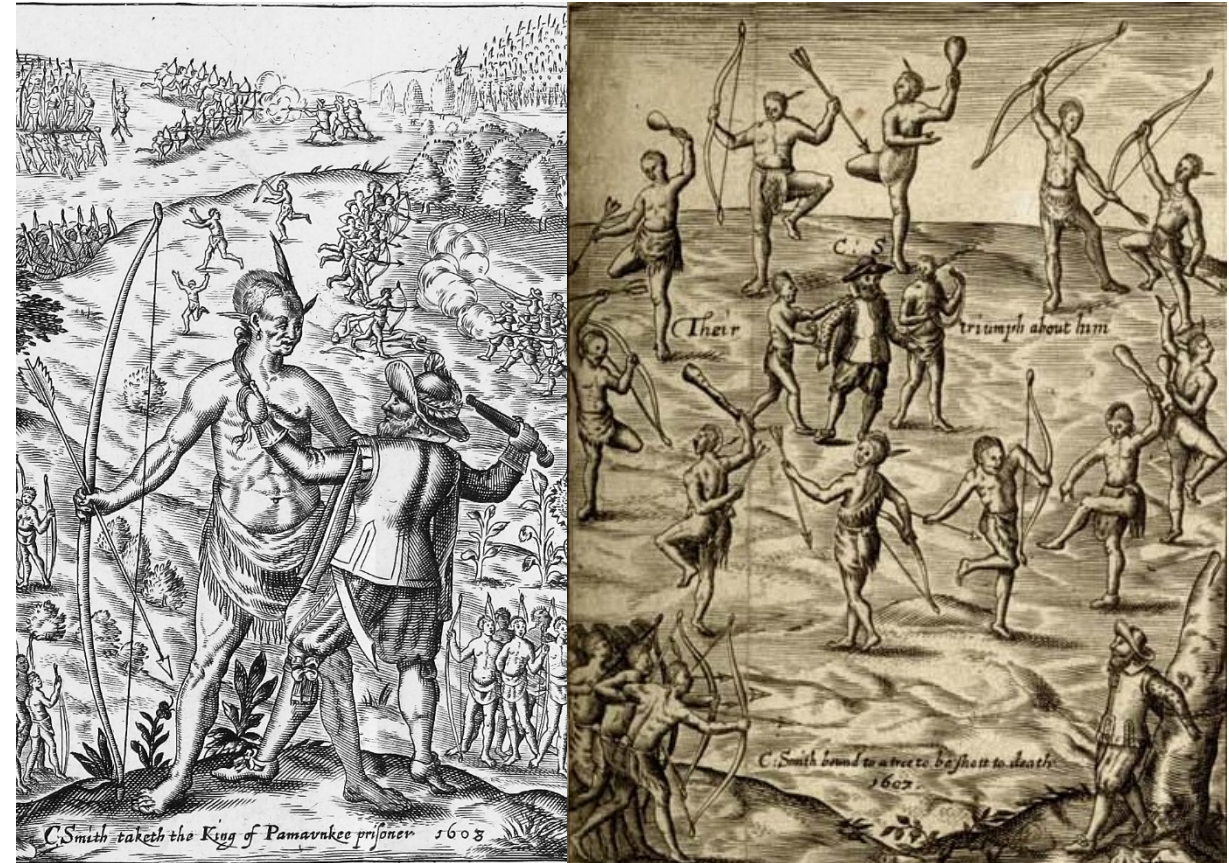
Left: John Smith's alleged heroism: capture of an Indian chief. Right: John Smith as a captive led to the Indian village Orapac

The notorious case is the partially invented story of the rescue of Smith and the whole colony by Pocahontas (actually Matoaka), the daughter of the Indian chief Powhatan. The truth is that Pocahontas was captured by the colonists , baptized (named Rebecca) and forced to marry John Rolfe , a tobacco planter. She died in England and the circumstances of her death have not been clarified. Her invented romance was exploited in popular culture (Walt Disney).