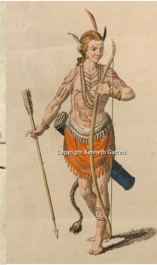
White's drawing of a Secotan warrior