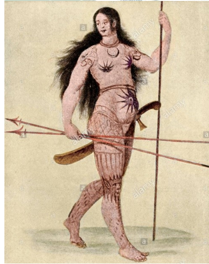
White's imaginary drawing of a Pictish woman warrior