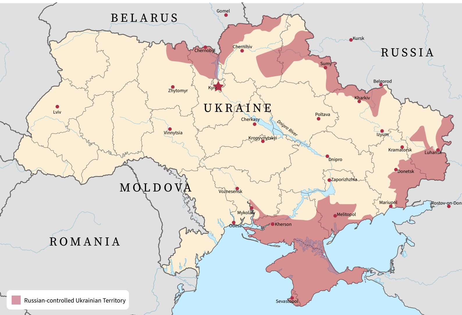
Figure 3: Map of Ukraine on 27 February