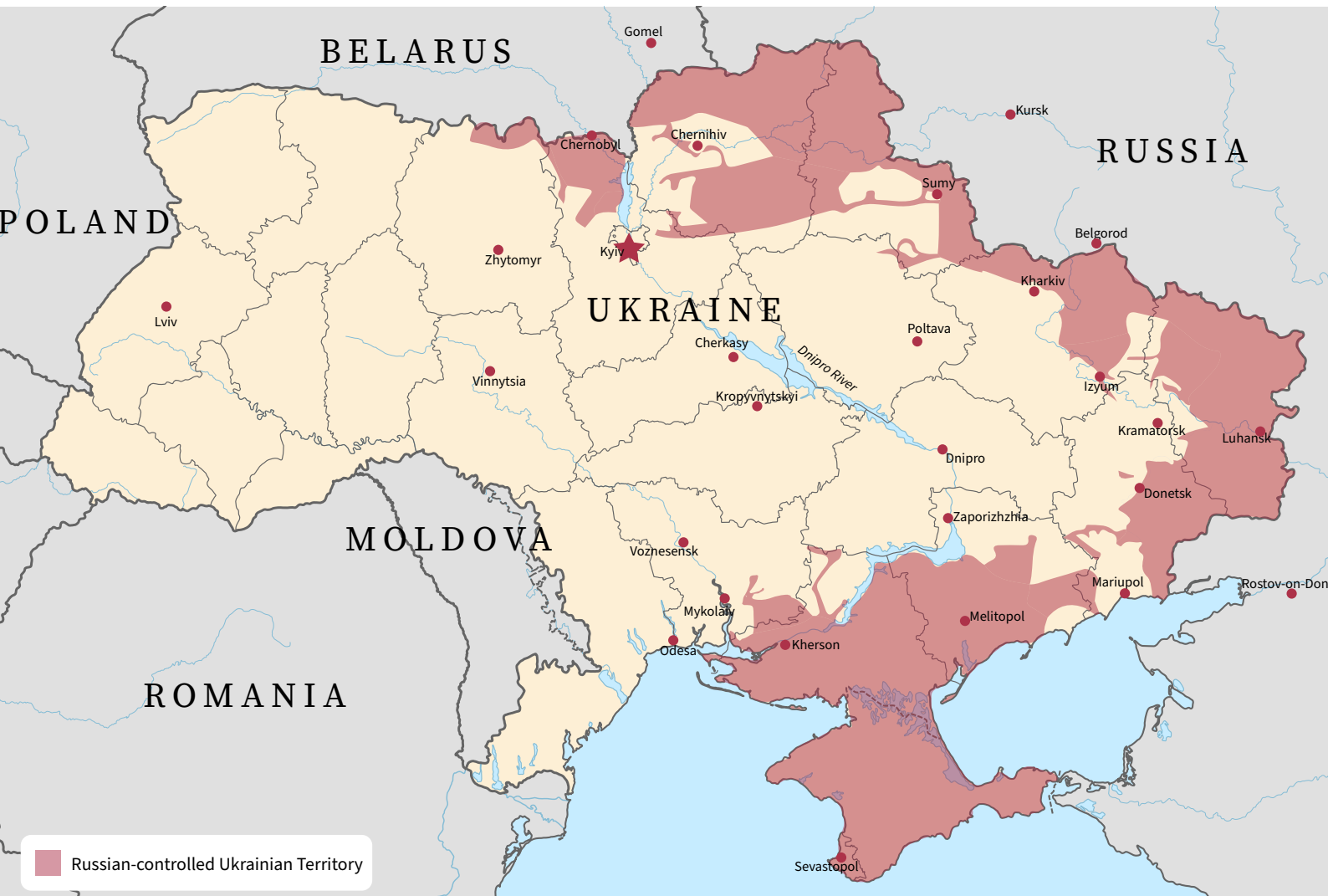
Figure 4: Map of Ukraine on 2 April