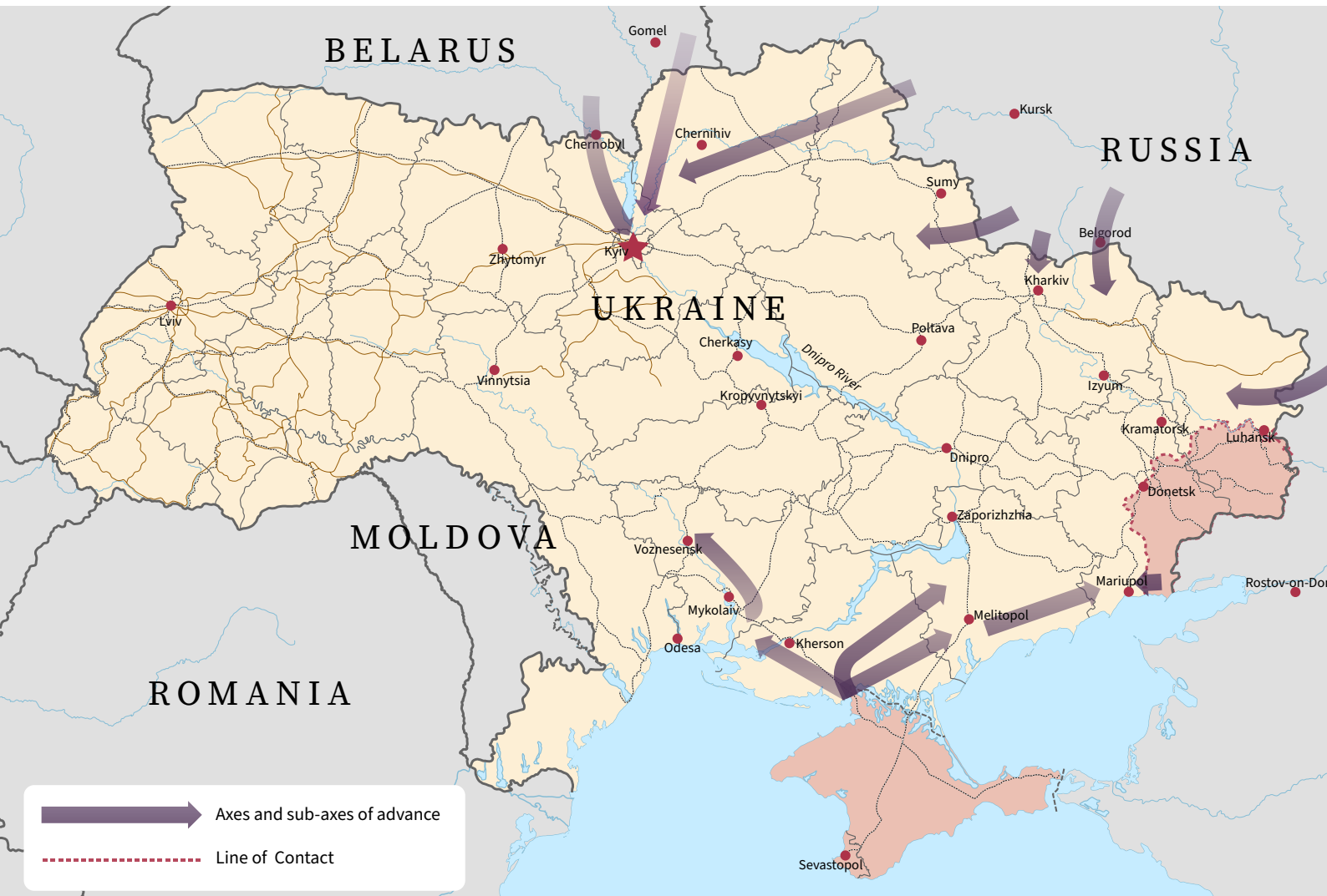
Figure 1: Original Russian Axes of Advance