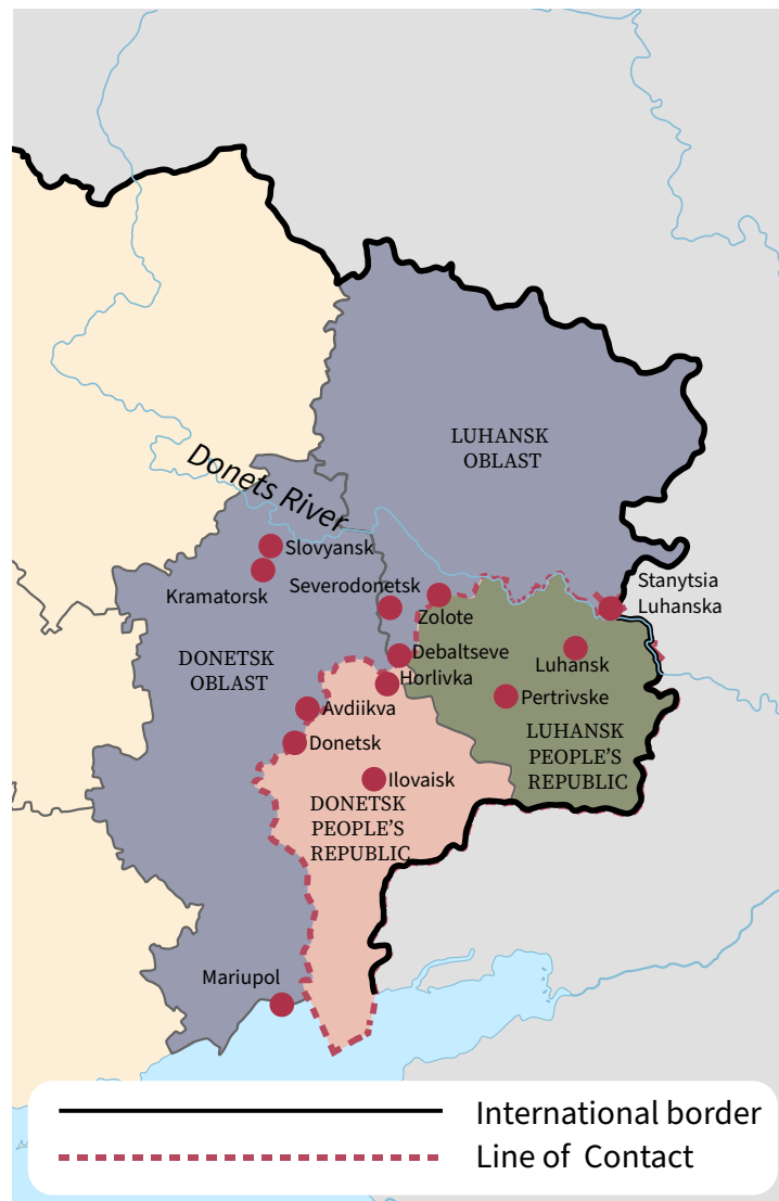
Figure 2: The Line of Contact