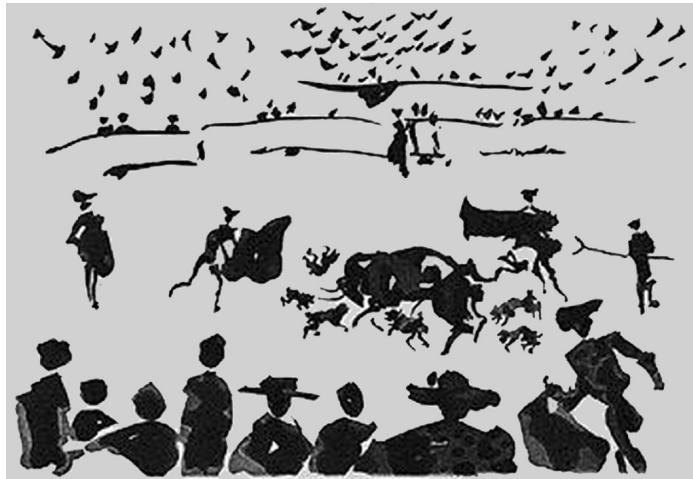
Pablo Picasso, Dogs Set on the Bull , Aquatint, 1959

They certainly belong to the same category. Both are executed in the same style, in the same period, by the same artist, on the same subject matter, using the same technique – they even have the same measurements (35.5 x 50 cm). As a matter of fact, one might have difficulty finding works of art more similar than these. 42 Questions like 'Which of the two pictures is better balanced, more coherent, more harmonious?' may be difficult to answer, but they are far from silly. Yet, Wollheim's dictum that 'the coherence that we look for in a work of art