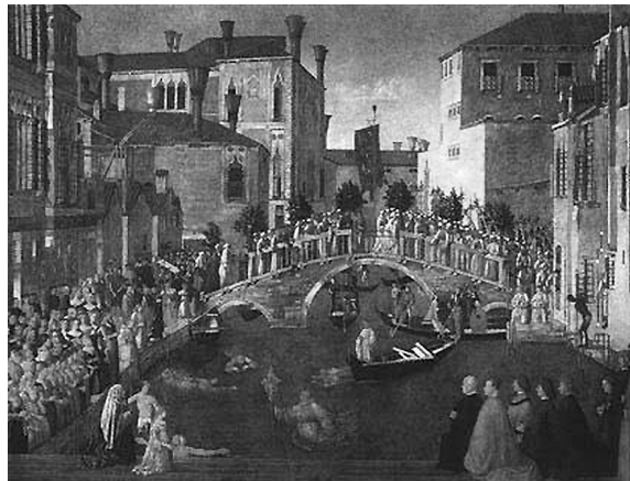
Gentile Bellini, Miracle of the True Cross at the Bridge of S. Lorenzo

Let me illustrate this. We can agree, I assume, that the following three paintings are all well balanced, that their compositions are harmonious, that each of them can serve as an example of a successful harmonization of the elements and features that have been assembled within its frame. Yet there is nothing that the three pictures have in common, apart from the fact that the aesthetic predicate 'well balanced' applies to them.