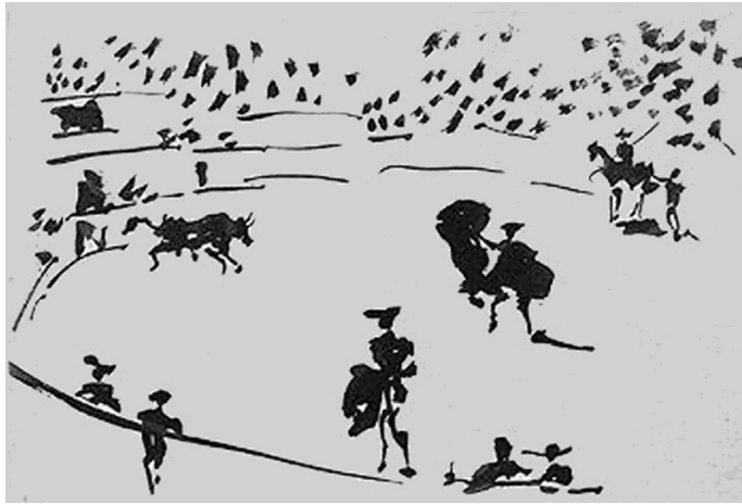
Pablo Picasso, The Bull Leaves the Bull Pen , Aquatint, 1959