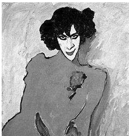
Alexej von Jawlensky, Portrait of Alexander Sacharoff