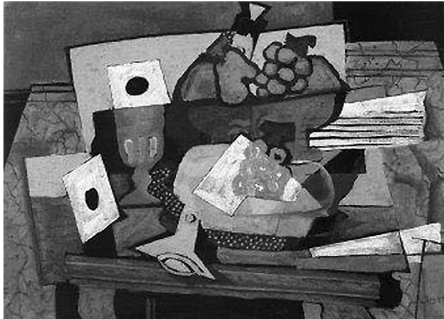
Georges Braque, Still Life with Grapes and Clarinet

Aesthetic properties such as 'being well balanced' are thus indexical in the sense that they are specific to each individual work and differ from instance to instance: the harmonization of (non-aesthetic) features and elements in Bellini's painting is quite different from that in Jawlensky's portrait, which again differ from those of the well-balanced composition of Braque's still life.