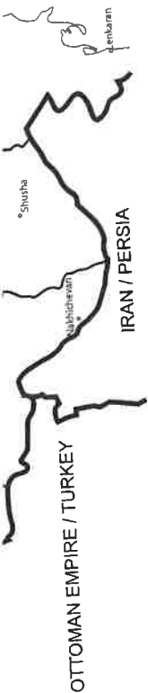
Map 7.1 Tsarist Russian administrative map of the Caucasus, 1904–14.