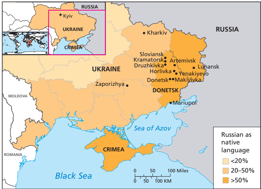
Figure 3.1 Map of Eastern Ukraine