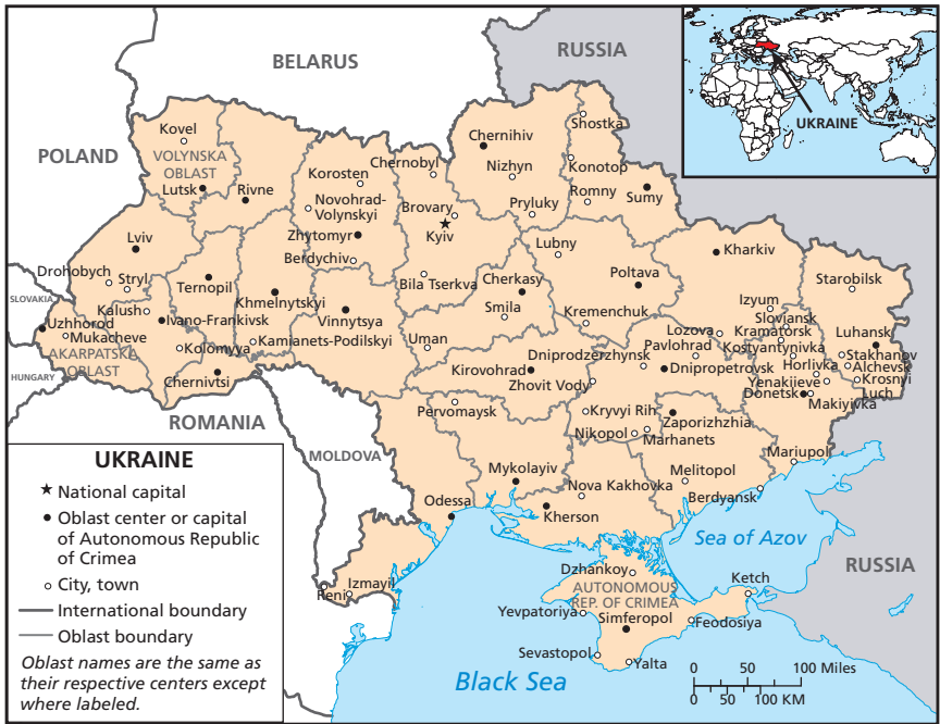
Figure 1.1 Map of Ukraine