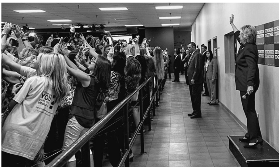
Figure 0.3 People with smartphones documenting an election campaign event by Hillary Clinton in Orlando, Florida, on 21 September 2016. Barbara Kinney

Source: Barbara Kinney, www.flickr.com/photos/hillaryclinton/29845603875