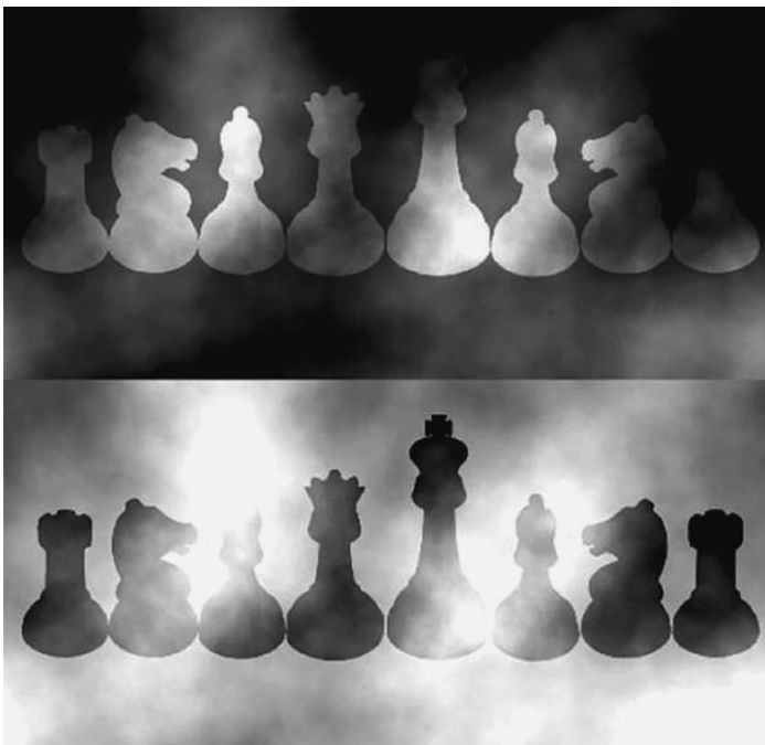
Figure 0.5 Lightness illusion

The illusion of authenticity also masks the political values that such photographic representations embody. The assumption that photographs are neutral, value-free and evidential, is reinforced because photography captures faces and events in memorable ways. For instance, if one looks at a close-up of a victim of a humanitarian crisis one could easily believe that one actually sees that person as he or she was at that moment. Michael Shapiro (1988: 124, 134) writes of a “grammar of face-to-face encounters.” And he stresses that the seemingly naturalistic nature of this encounter makes photographic representations particularly vulnerable to being appropriated by discourses professing authentic knowledge and truth. We may succumb to such a “seductiveness of the real” to the point that we forget, as David Perlmutter (1998: 28) warns us, that “the lens is focused by a hand directed by a human eye.” Add to this that the public