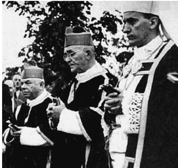
Figure 0.7 Cropped version of Figure 0.6