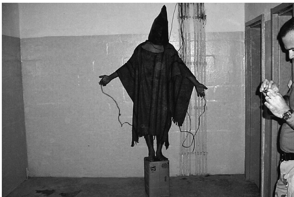
Figure 0.9 An unidentified Abu Ghraib detainee, seen in a 2003 photo

First is the debate on the use of torture in the War on Terror. As early as the summer of 2003, it was publicly known – in part through reports from Amnesty International – that US troops were using torture techniques when interrogating prisoners in Iraq.