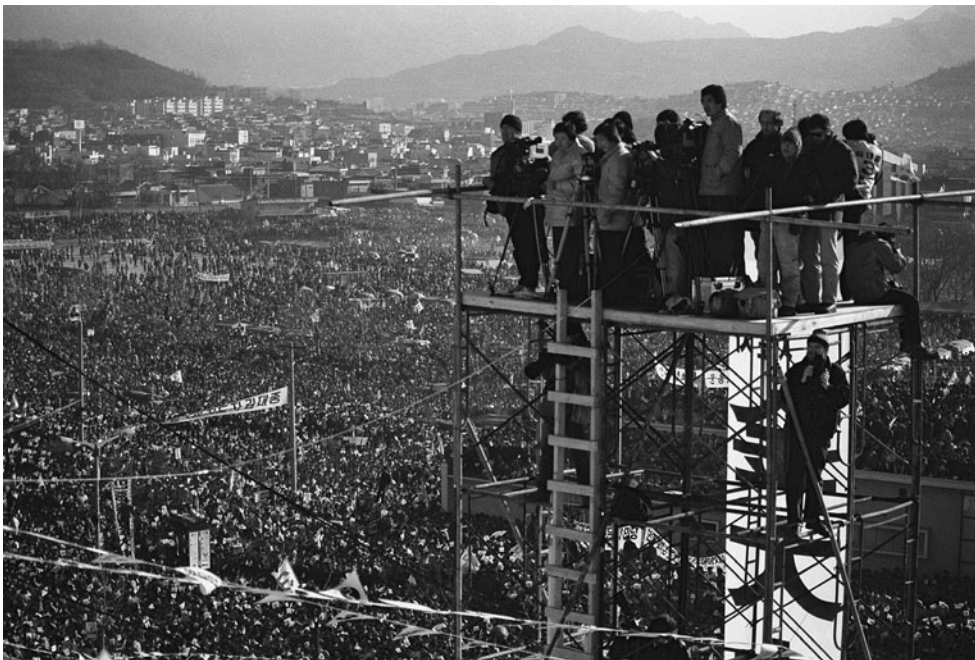
Figure 0.2 Film and photojournalists covering an election campaign rally by Kim Dae-Jung, Seoul, South Korea, 1987

Second is what one could call the democratisation of visual politics. It used to be that very few actors – states or global media networks – had access to images and the power to distribute them to a global audience. Today, everyone can take a photograph with a smartphone, upload it on social media and circulate it immediately with a potential worldwide reach. Every two minutes, people upload more photographs than there were in total 150 years ago (Eveleth 2015 in Kaempf, Chapter 12).