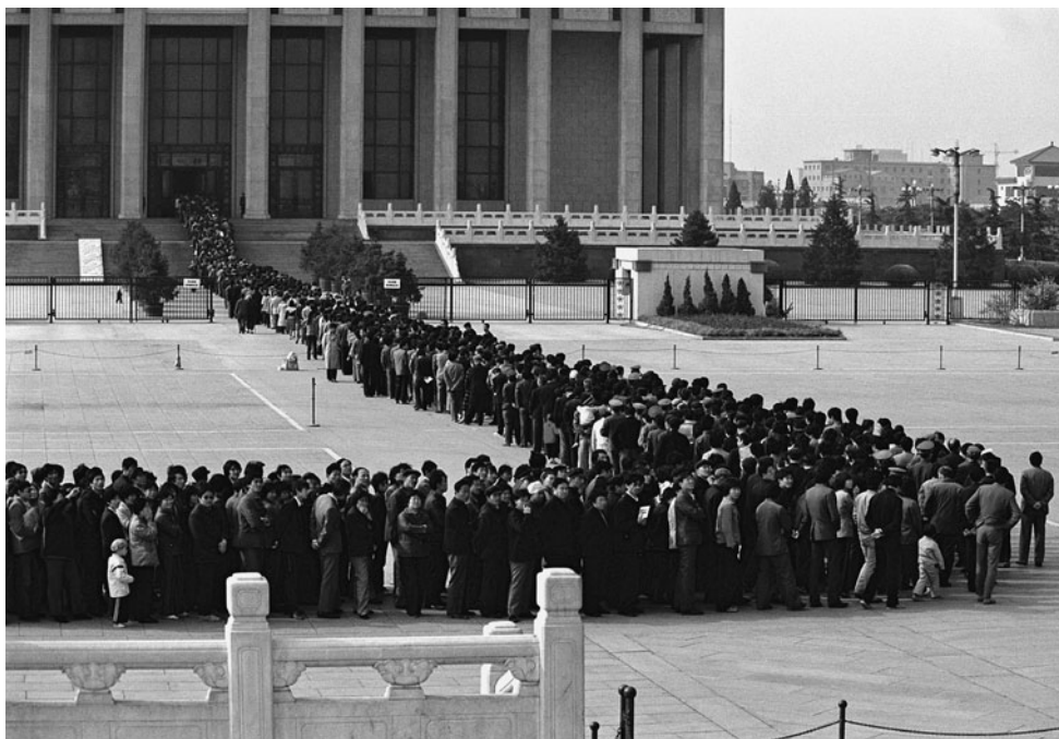
Figure 0.13 Mausoleum of Mao Zedong, Beijing, 1987

Images and visual artefacts obviously do a lot of things. So let me just focus on one realm as an illustration. It is an important realm: how images and artefacts visually depict and perform and thus politically frame a sense of identity and community. This