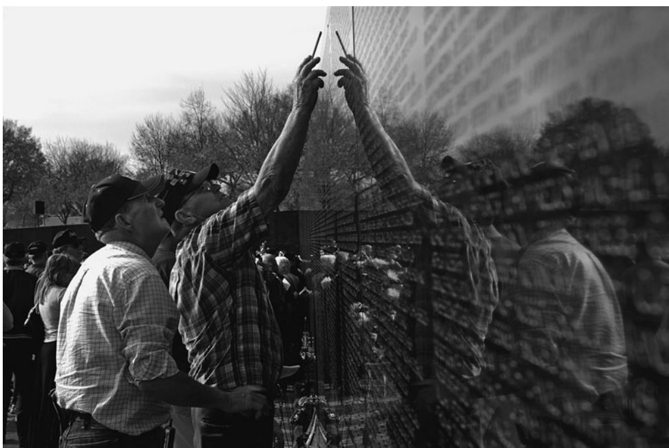
Figure 0.1 US veterans point out a familiar name at the Vietnam Veterans Memorial following a Veterans Day ceremony, 11 November 2006

Second: images and visual artefacts tell us something about the world and, perhaps more importantly, about how we see the world. They are witnesses of our time and