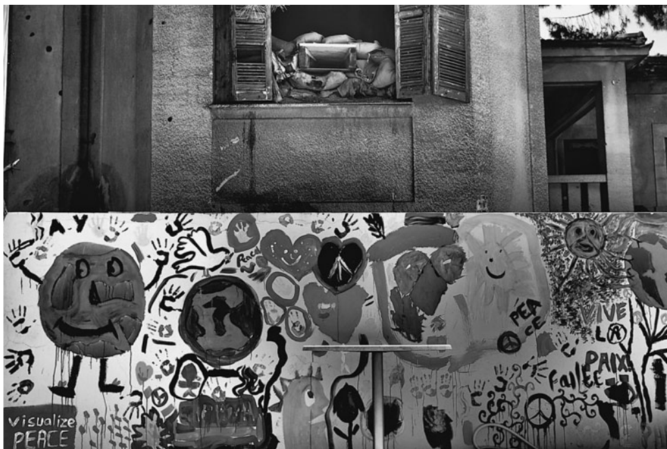
Figure 0.11 How to visualise peace? United Nations Buffer Zone in Nicosia, Cyprus, July 2014