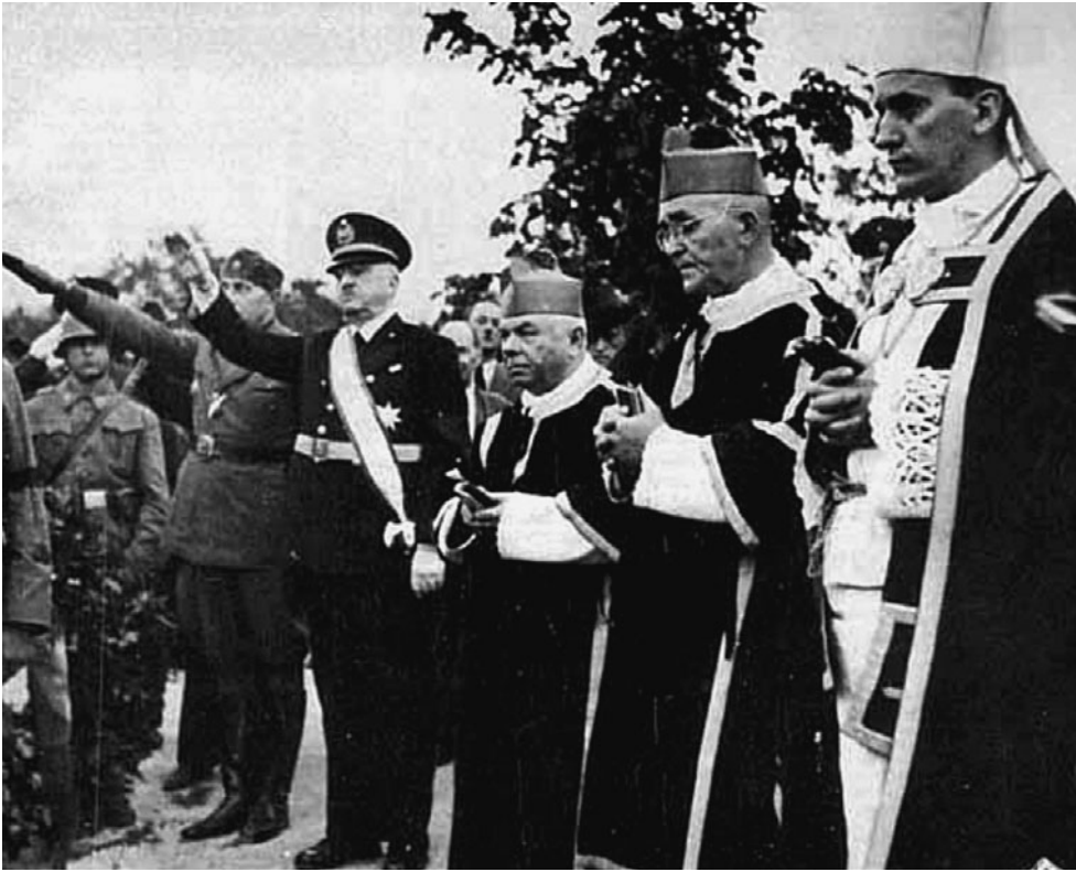
Figure 0.6 Alojzije Stepinac (far right) with two Catholic priests at the funeral of President of the Croatian Parliament Marko Došen in September 1944