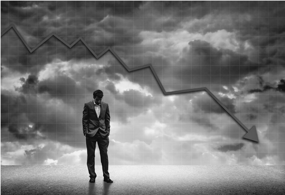
Figure 0.10 Man in a bear market – losing money in the markets, Jack Moreth

Source: Jack Moreth, www.stockvault.net/photo/193457/man-in-a-bear-market---losing-money-in-the-markets/ Freely available at Stockvault.