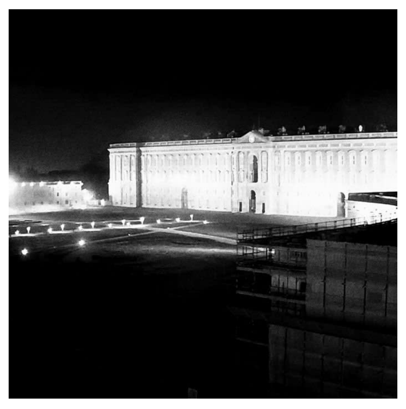
The Royal Palace of Caserta