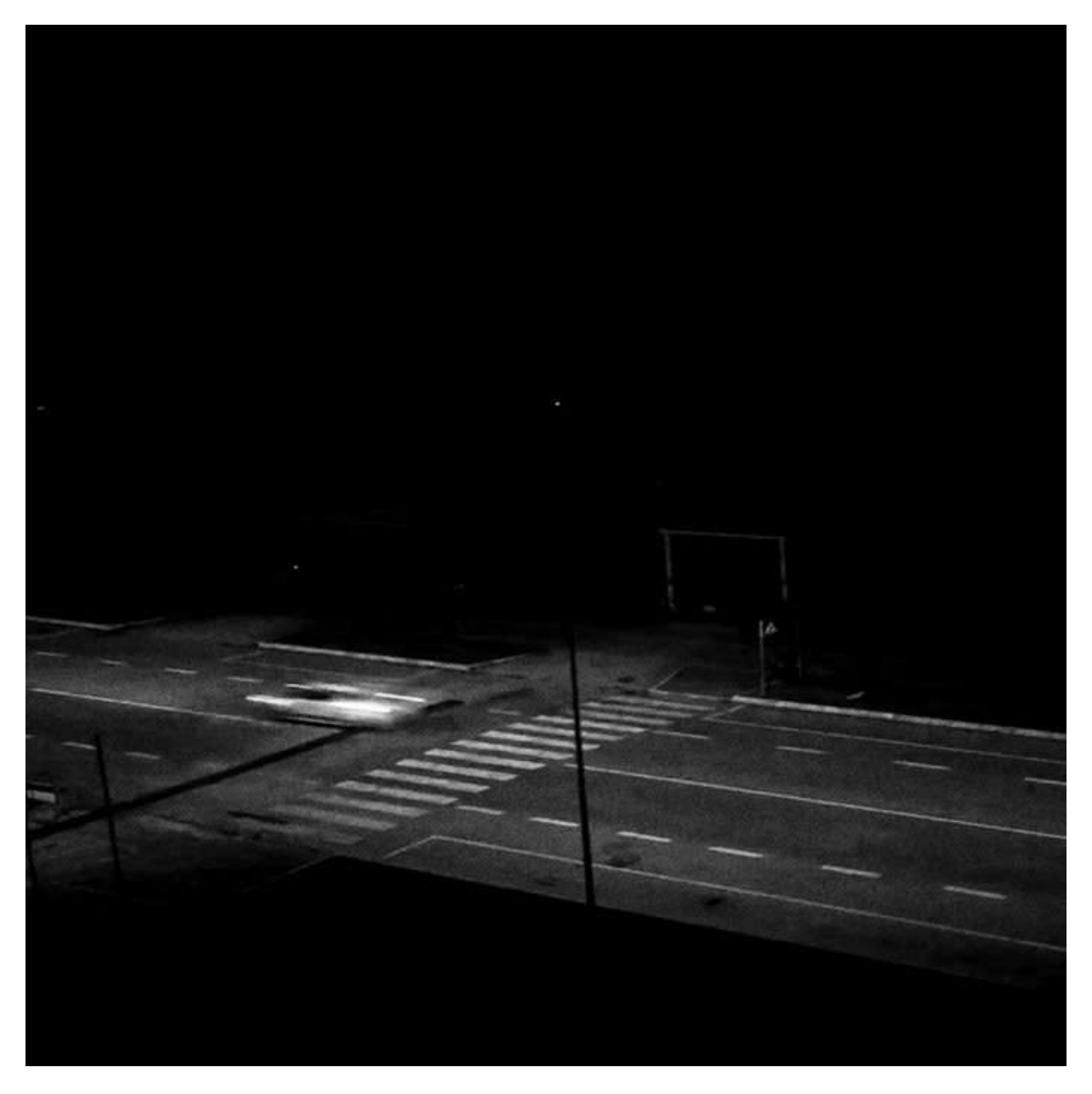
Lungomare di Forte dei Marmi, in Versilia

But to achieve such a level of compliance and co-operation, you need trust. People need to trust science, to trust public authorities, and to trust the media. Over the past few years, irresponsible politicians have deliberately undermined trust in science, in public authorities and in the media. Now these same irresponsible politicians might be tempted to take the high road to authoritarianism, arguing that you just cannot trust the public to do the right thing.