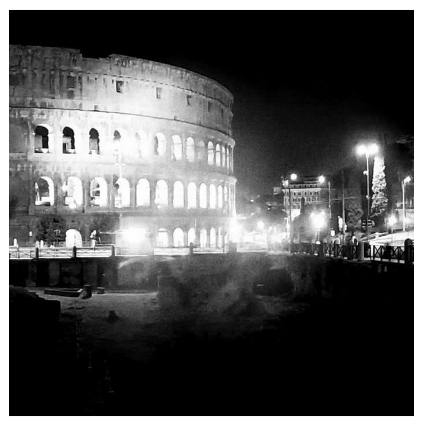
The Colosseum in Rome