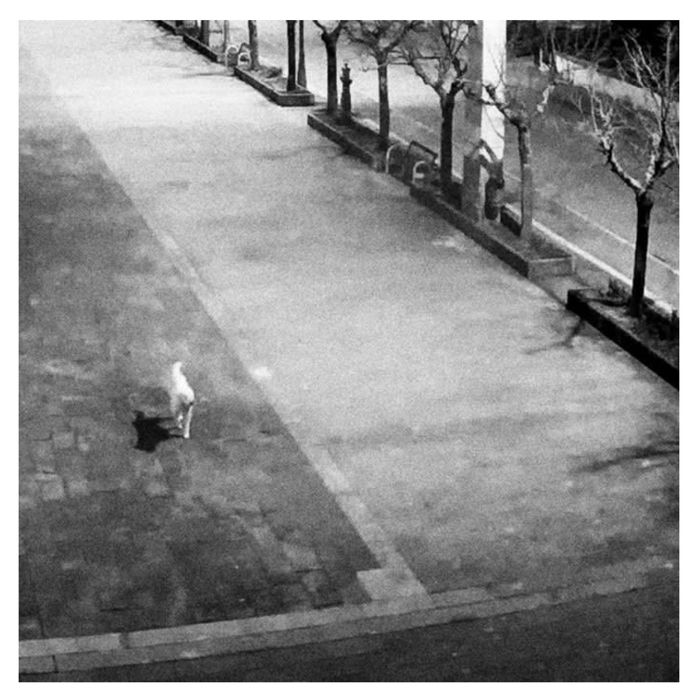
Piazza Beato Roberto in Pescara

In their battle against the coronavirus epidemic several governments have already deployed the new surveillance tools. The most notable case is China. By closely monitoring people's smartphones, making use of hundreds of millions of face-recognising cameras, and obliging people to check and report their body temperature and medical condition, the Chinese authorities can not only quickly identify suspected coronavirus carriers, but also track their movements and identify anyone they came into contact with. A range of mobile apps warn citizens about their