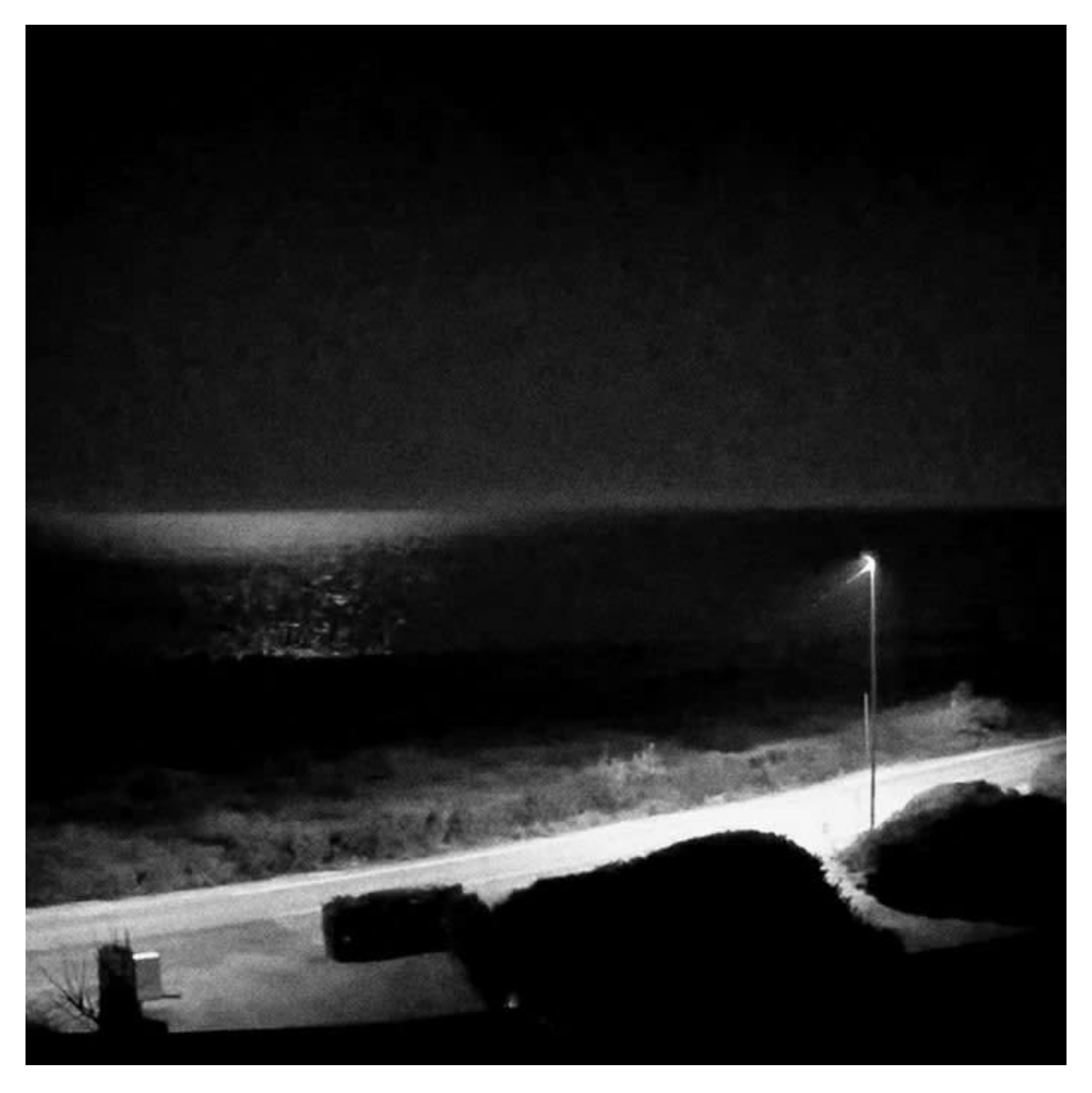
Torre San Giovanni, in Lecce

Unfortunately, at present countries hardly do any of these things. A collective paralysis has gripped the international community. There seem to be no adults in the room. One would have expected to see already weeks ago an emergency meeting of global leaders to come up with a common plan of action. The G7 leaders managed to organise a videoconference only this week, and it did not result in any such plan.