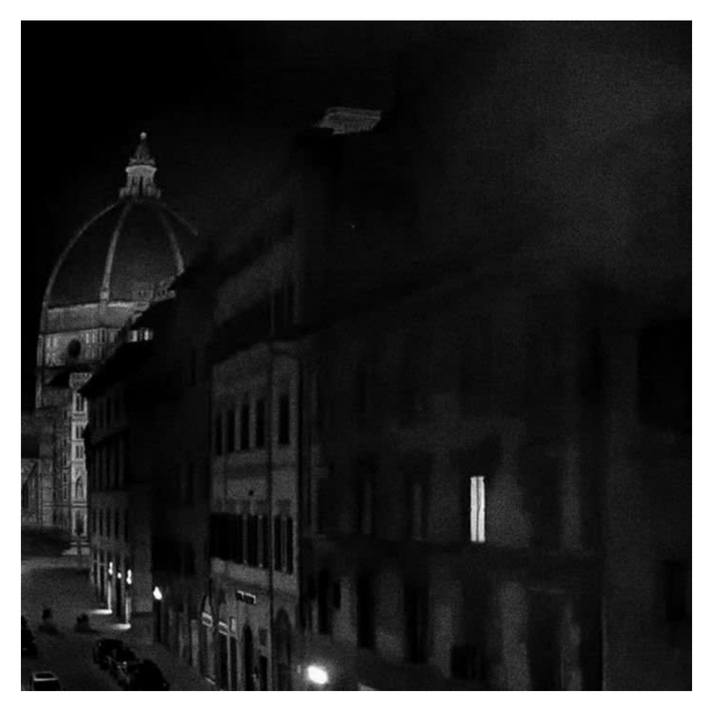
The Duomo in Florence