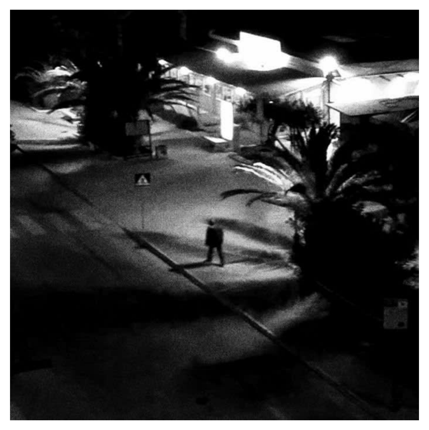
Spiaggia di Porto San Giorgio, Mare Adriatico

You could, of course, make the case for biometric surveillance as a temporary measure taken during a state of emergency. It would go away once the emergency is over. But temporary measures have a nasty habit of outlasting emergencies, especially as there is always a new emergency lurking on the horizon. My home country of Israel, for example, declared a state of emergency during its 1948 War of Independence, which justified a range of temporary measures from press censorship and land confiscation to special regulations for making