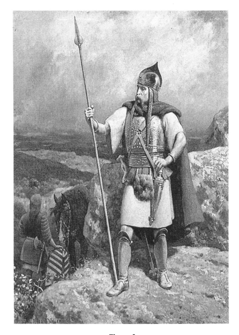
Figure 3 Painting of a "Gallic chief near the Roche Salvée of Beuvray inspecting the horizon," by Jules Didier (1895).

However, the artists assembled anachronistic collections of items drawn from past eras ranging from the Bronze Age to the Merovingean period. The statue of Vercingetorix at Alésia is a prime example of this practice (Figure 1), as is a painting by Jules Didier showing a "Gallic chief" wearing a mix of items including Bronze Age armor and what appears to be a form of kilt complete with sporan (Figure 3).<sup>15</sup> Despite the chronological and cultural discrepancies involved in the association of this material, for the nonspecialist they lend an aura of authenticity that is impervious to the criticism of scholars. The reinvention of druidism and its association with Celtic fire festivals at Burgundian archaeological sites and with Stonehenge offer further examples of the inventive incorporation of archaeological monuments in traditions of Celticity (Crumley 1991; Piggott 1968).