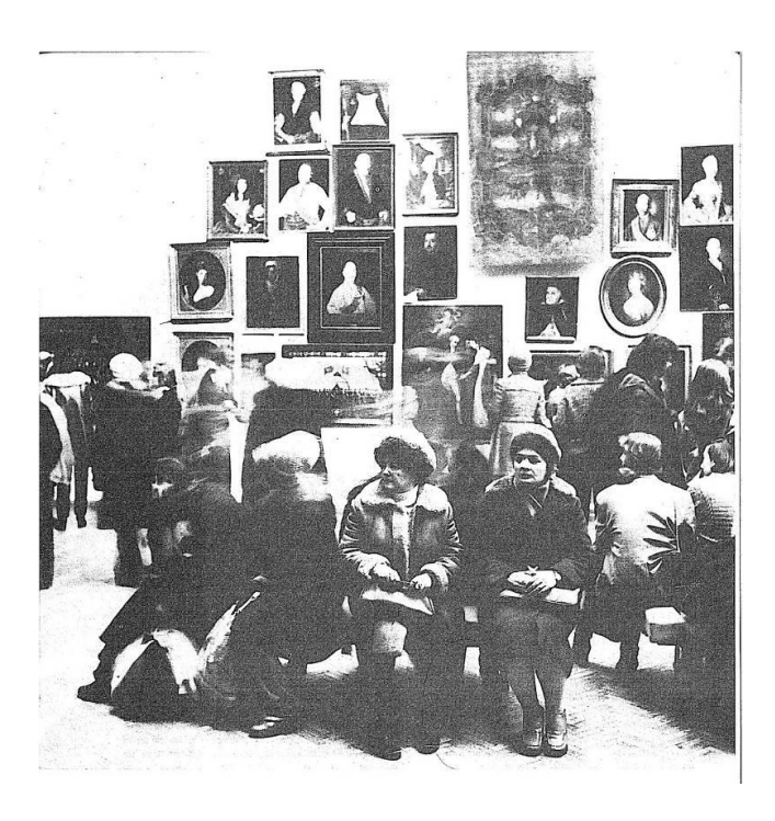
Figure 6 From the exhibition Polaków portret własny [Self-Portrait of the Nation], Kraków 1979, in: Marek Rostworowski, Polaków portret własny, V. 2: The descriptions of the illustrations.

How then were the presentations of the Polish Baroque portraits generally received by the wider public? Can they be looked upon as an instrument of an overarching government strategy? Or was their reception simply a matter of personal interpretation (Figure 6)? The Polish Portrait of the Seventeenth and Eighteenth Centuries exhibition was widely commented upon in the Polish press. It was reported on by at least eighteen national and local newspapers. Articles included long critical reviews and richly illustrated reports. Almost every one of them started with an account of the exhibition's travels in the Soviet Union and its huge success there. <sup>49</sup> Art historian Andrzej Osęka, in his review 'Portrait with a face' in the magazine Kultura , underlined the distinction between Polish Baroque painting and