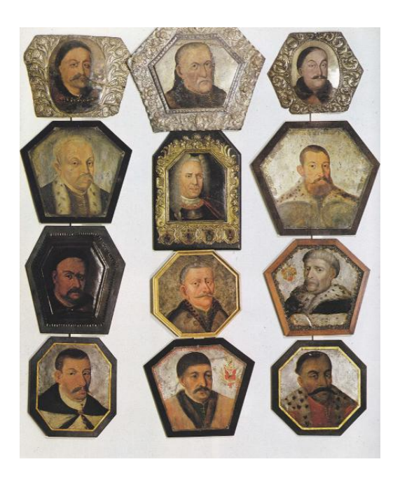
Figure 7 Coffin portraits of noblemen, 17<sup>th</sup>–18<sup>th</sup> century, from the exhibition Polaków portret własny [Self-Portrait of the Nation], Kraków 1979, in: Marek Rostworowski, Polaków portret własny, V. 1: Illustrations, Warszawa 1983, il. 136.

Sarmats! Those awful, monstrous mugs! [...] One could see everything written on those faces: immense drunkenness, arrogance, stupidity. We went to see the display as if we were visiting a zoo housing the genuine Polish behemoth, in its true clothes, character, features. And to compare it with the contemporary monstrosity. It was a wonderful presentation of the Polish raw, unpolished emotions and personalities, real flesh, no artificial colour, no pretence.<sup>64</sup>