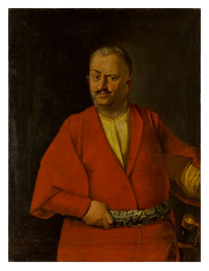
Figure 2 Unknown artist, Portrait of a nobleman without an ear, c. 1750, Tarnów, District Museum.

objects that 'speak and give life to the silent relics of the past'<sup>14</sup> – these silent relics being a selection of memorabilia of the seventeenth century, including armour, clothing and craft objects. The author of the exhibition catalogue, Marian Sokołowski, attempted to distinguish what he perceived as the shared feature that unified the paintings: a feeling of 'spiritual predominance' and of 'theatrical gravity'. His efforts can be seen as the first attempt to create a separate stylistic category reserved especially for the Baroque portrait in Poland.