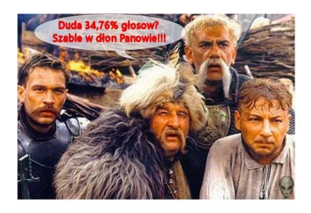
Figure~10~Internet~Meme,~accessed~11~May~2015~http://www.dziennikbaltycki.pl/artykul/3856979, wybory-prezydenckie-2015-memy-po-pierwszej-turze-wyborow, id, t.html.