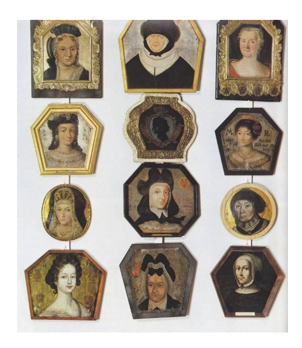
Figure 8 Coffin portraits of noblewomen, 17th—18th century, from the exhibition Polaków portret własny [Self-Portrait of the Nation], Kraków 1979, in: Marek Rostworowski, Polaków portret własny, V. 1: Illustrations, Warszawa 1983, il. 137.

In the same time, the press offered an ideologically correct interpretation of the exhibition. Jerzy Madeyski described the changeover from the Baroque to the Rococo in the following words: