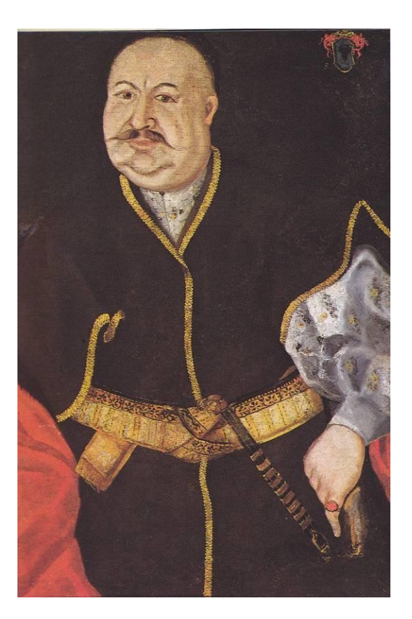
Figure 5 Unknown artist, Portrait of a nobleman the Wieniawa coat of arms (from the Libiszowski family?), after 1750, Sieradz, District Museum.