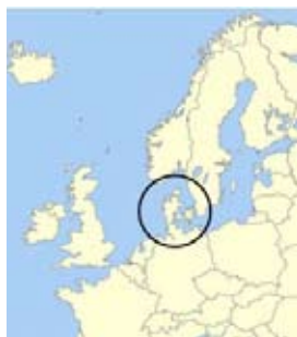
Denmark: 43,000 km2 of islands and one peninsula bridg- ing Scandinavia and the Euro- pean continent.