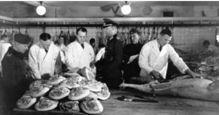
German inspectors at a Danish export slaughterhouse: Denmark became an important part of the German war economy and was able to gain political maneuvering space. The need for supplies and racial considerations motivated the moderate German occupation policy 1940-45.