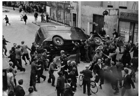
The ‘August Uprising’ is also directed against the Danish authorities’ compliance with the occupying power. Here, a Danish police vehicle is overturned by protesters during the general strike.