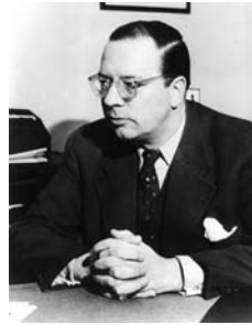
G.F. Duckwitz (1904-73), a long-time Nazi party member, worked for the German embassy in Copenhagen as an expert on maritime issues and was a member of the German intelligence