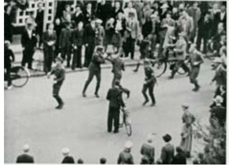
August 1943: the funeral of an executed saboteur in Aalborg develops into a mass gathering, and demonstrators boldly assault German soldiers.

The actual commencement of the operation was postponed somewhat, probably because the Germans wanted to end ongoing trade negotiations on next year’s Danish supplies to the Reich first. On October 1, 1943 they were brought to an end, and on that very evening the operation began.