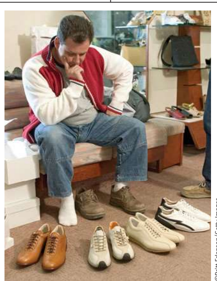
One must choose.

Many important economic interactions can be understood by looking at the markets for individual goods, like the market for corn. But an economy as a whole has its ups and downs—and we therefore need to understand economy-wide interactions as well as the more limited interactions that occur in individual markets.