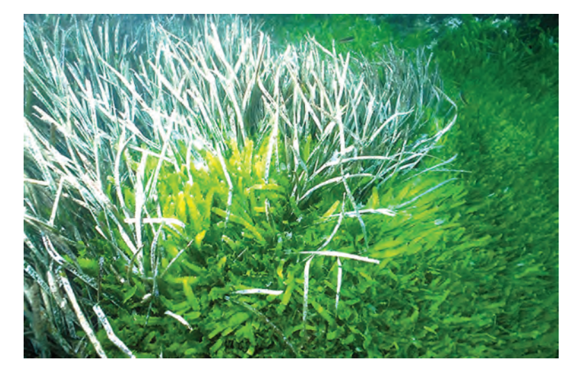
Figure 7.1 Caulerpa taxifolia.

Introduced plants can change entire ecosystems by modifying water or nutrient regimes. At Eagle Borax Spring in California, Mediterranean salt cedars ( Tamarix spp.) dried up a large marsh (McDaniel et al. 2005), while in Israel, Australian eucalyptus trees were deliberately introduced to drain swamps (Calder 2002). By fertilizing nitrogen-poor sites, introduced nitrogen-fixing plants can favor other exotic species over natives. On the geologically young, nitrogen-poor volcanic island of Hawaii, firetree ( Morella faya ), a nitrogen-fixing shrub from the Azores, creates conditions that favor other introduced species that previously could not thrive in the low-nutrient