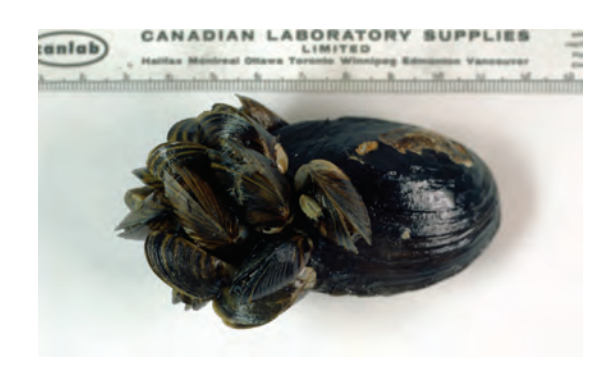
Figure 7.2 Zebra mussel.