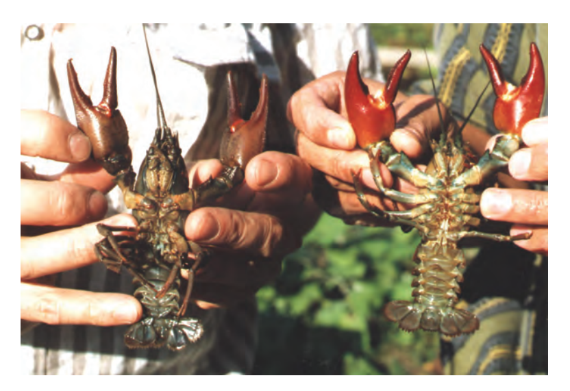
Figure 7.4 North American red signal crayfish (right) and a native European crayfish (Astacus astacus).

Of course, many introduced diseases have affected particular native species or groups of them without modifying an entire ecosystem. For instance, avian malaria, caused by Plasmodium re lictum capristranoae , introduced with Asian birds and vectored by previously introduced mosquitoes, contributed to the extinction of several native Hawaiian birds and helps restrict many of the remaining species to upper elevations, where mosquitoes are absent or infrequent (Woodworth et al. 2005). In Europe, crayfish plague ( Aphano myces astaci ), introduced with the North American red signal crayfish ( Pacifastacus lenusculus ; Figure 7.4 and Plate 7) and also vectored by the subsequently introduced Lousiana crayfish