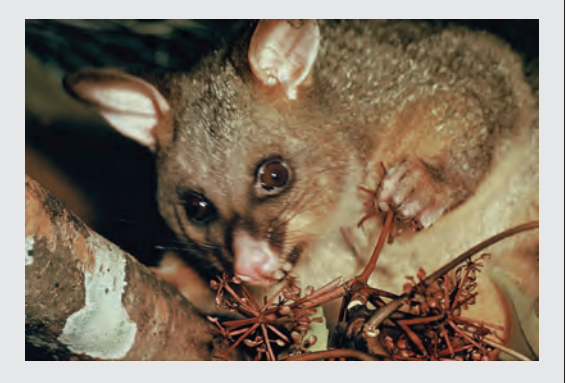
Box 7.2 Figure Brushtail possum.

Among the estimated 2200 established introduced invertebrate species in