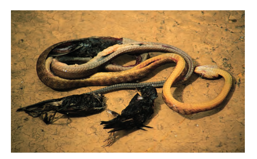
Figure 7.3 Brown tree snake.

Many predators have been deliberately introduced for "biological control" of previously introduced species (see below), and a number of these have succeeded in keeping populations of the target species at greatly reduced levels. For instance, introduction of the Australian vedalia