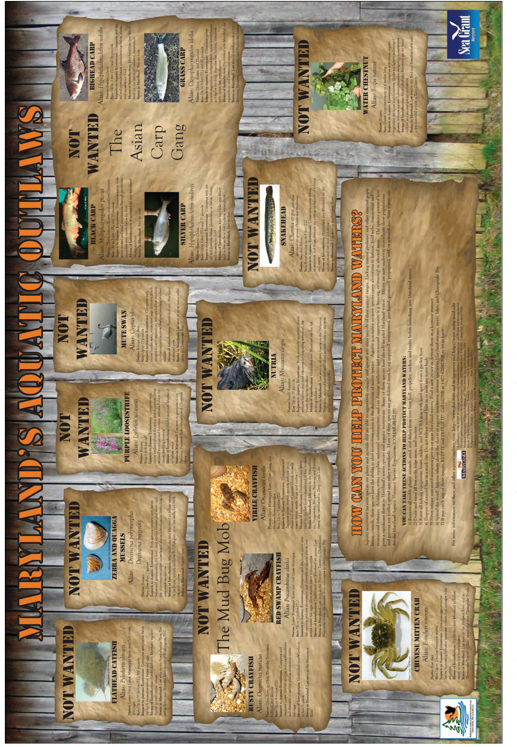
Figure 7.6 Maryland's aquatic invasive species. Poster courtesy of the Maryland Department of Natural Resources.