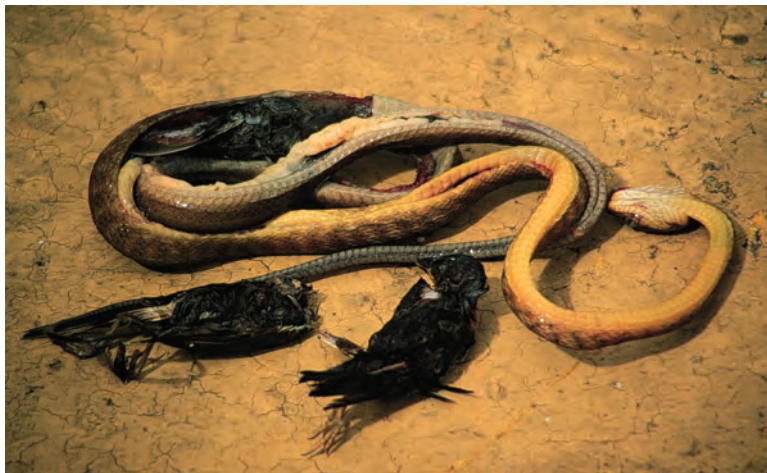
Figure 7.3 Brown tree snake.

Many predators have been deliberately introduced for "biological control" of previously introduced species (see below), and a number of these have succeeded in keeping populations of the target species at greatly reduced levels. For instance, introduction of the Australian vedalia