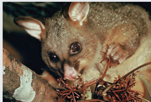
Box 7.2 Figure Brushtail possum.

Among the estimated 2200 established introduced invertebrate species in