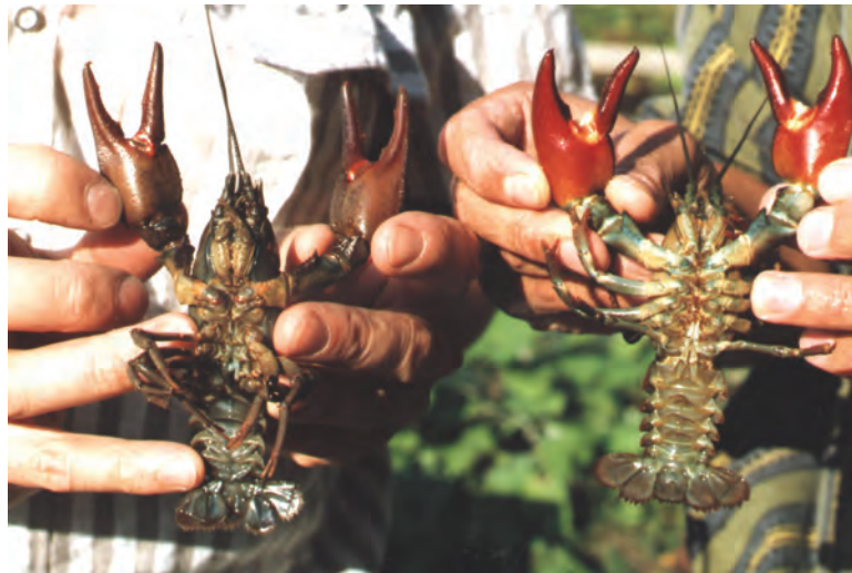
Figure 7.4 North American red signal crayfish (right) and a native European crayfish ( Astacus astacus ).

Of course, many introduced diseases have affected particular native species or groups of them without modifying an entire ecosystem. For instance, avian malaria, caused by Plasmodium relictum capistranoae , introduced with Asian birds and vectored by previously introduced mosquitoes, contributed to the extinction of several native Hawaiian birds and helps restrict many of the remaining species to upper elevations, where mosquitoes are absent or infrequent (Woodworth et al. 2005). In Europe, crayfish plague ( Aphanomyces astaci ), introduced with the North American red signal crayfish ( Pacifastacus lenusculus ; Figure 7.4 and Plate 7) and also vectored by the subsequently introduced Louisiana crayfish