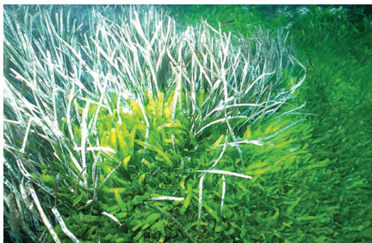
Figure 7.1 Caulerpa taxifolia .

Introduced plants can change entire ecosystems by modifying water or nutrient regimes. At Eagle Borax Spring in California, Mediterranean salt cedars ( Tamarix spp.) dried up a large marsh (McDaniel et al. 2005), while in Israel, Australian eucalyptus trees were deliberately introduced to drain swamps (Calder 2002). By fertilizing nitrogen-poor sites, introduced nitrogen-fixing plants can favor other exotic species over natives. On the geologically young, nitrogen-poor volcanic island of Hawaii, firetree ( Morella faya ), a nitrogen-fixing shrub from the Azores, creates conditions that favor other introduced species that previously could not thrive in the low-nutrient