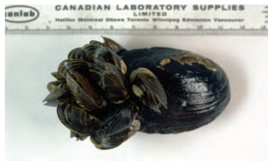
Figure 7.2 Zebra mussel.