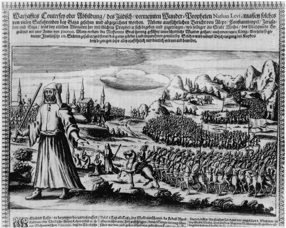
Nathan leading his people from Exile to the Holy Land, after (3) anointing of the new king Sabbatai and (4) the capture of Mecca. (6) At the head of the army, the general Josua Helkam. Also depicted are (2) the Tables of the Law being dug up and (5) Mohammed's corpse being thrown out of the mosque. Fictitious etching from a German broadsheet: Warhaftes Conterfey . . . des Jüdisch-vermeinten Wunder-Propheten Nathan Levi . . . (probably Augsburg, 1666)