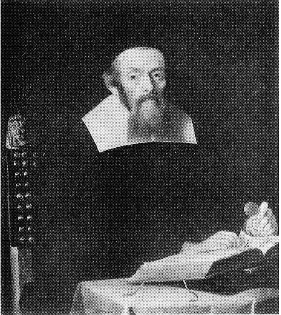
Portrait of Rabbi Jacob Sasportas, the adversary of Sabbatai Şevi. Oil, by Isaack Luttichuijs (Amsterdam, about 1680–90)