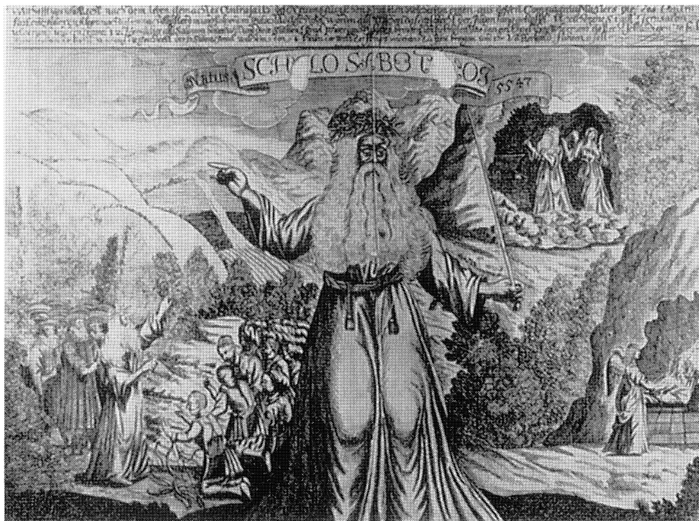
Fantastic engraving of Sabbatai Şevi bringing back the Jews to Israel. The heading “Sch[a]lo Sabot[t]oi” seems to mean Schalo[m] Sabbatai (1687, place unknown)