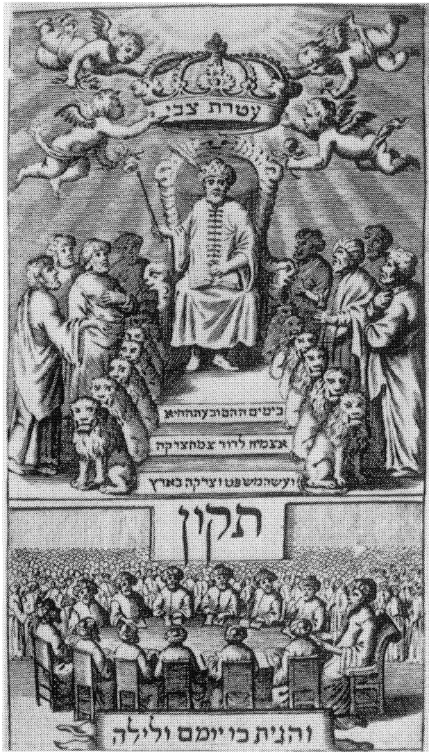
Sabbatai Şevi as messiah, sitting on the kingly throne, under a celestial crown held by angels and bearing the inscription "Crown of Şevi." Below: the Ten Tribes studying the Torah with the messiah. From an etching after the title page of one of the editions of Nathan's Tiqqun Qeri'ah (Amsterdam, 1666)