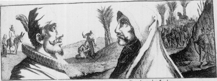
Den Nieuwen Jooden Koning.