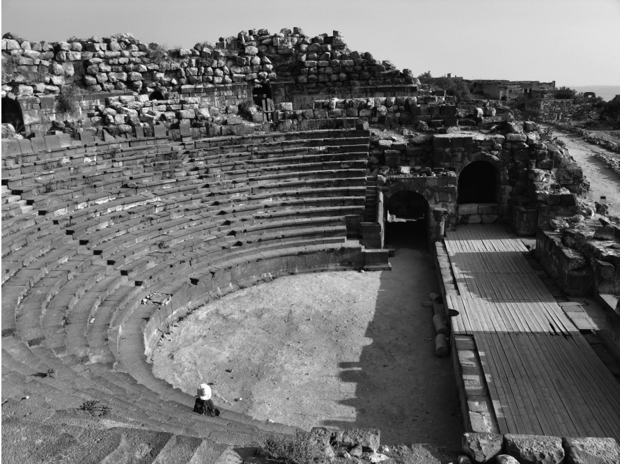
Fig. 1. Gadara, the western theater.