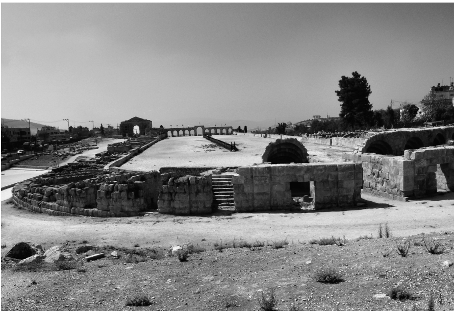
Fig. 2. Gerasa, the hippodrome, looking south.