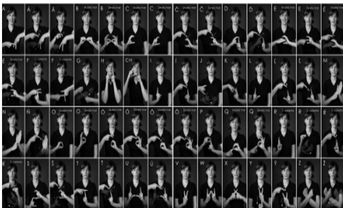
Fig. 2 Example of double-handed finger alphabet