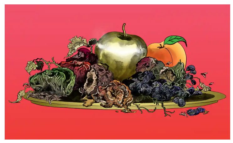
'The "out of sight, out of mind" externalization of poverty and poison doesn't go away just because we've covered our eyes with VR goggles.' Illustration: Matt Huynh

So instead of considering the practical ethics of impoverishing and exploiting the many in the name of the few, most academics, journalists, and science fiction writers instead considered much more abstract and fanciful conundrums: is it fair for a stock trader to use smart drugs? Should children get implants for foreign languages? Do we want autonomous vehicles to prioritize the lives of pedestrians over those of its passengers? Should the first Mars colonies be run as democracies? Does changing my DNA undermine my identity? Should robots have rights?