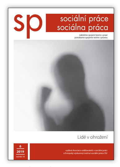
People at Risk