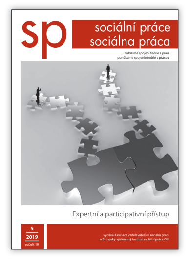
Expert and Participatory Approach

ISSN 1213-6204 (Print) ISSN 1805-885x (Online)