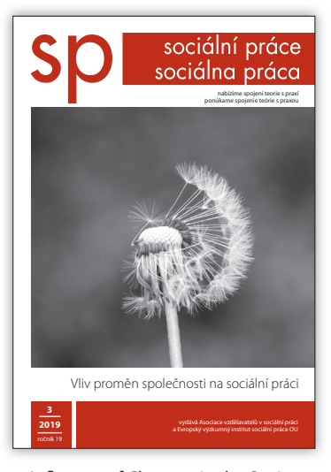
Influence of Changes in the Society on Social Work