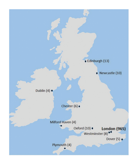
Fig. 1 British news in Dutch and Flemish (left) and German newspapers (right).

1618 and 1700 which appear at least three times in Dutch newspapers.<sup>11</sup> With over 13,000 reports coming from London, the capital city alone accounted for more than half of all reports. Edinburgh and Dublin with their around 2,500 and 1,200 reports were the only large and regular places of correspondence situated outside England.