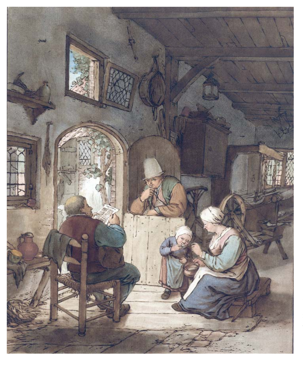
ILLUSTRATION 6.3 Cornelis Ploos van Amstel , Reading the news at the weavers' cottage (1766), after a drawing by Adriaen van Ostade ( c. 1673). RIJKSMUSEUM, AMSTERDAM, RP-P-0B-24.553

the political and mercantile elite.<sup>45</sup> Analysing a wealth of intercepted letters sent abroad from the Dutch Republic in 1672, Brouwer demonstrated that interest in political news was widely shared in Dutch society, including among individuals far removed from political decision-making. Wives and friends of merchants, skippers and artisans sent along copies of newspapers with their letters to the East Indies or Surinam. The drawings of the Haarlem artist Adriaen van Ostade, a specialist of homely tavern and workshop scenes, portray several newspaper readers in the act of reading.<sup>46</sup> Around 1673 Van Ostade captured not the wealthy regent with his weekly newspaper, but a weaver enjoying the same pleasure in his cottage (see ill. 6.3). Tavern scenes by Jan Steen and Cornelis Dusart from the same period also contain pictorial evidence of the