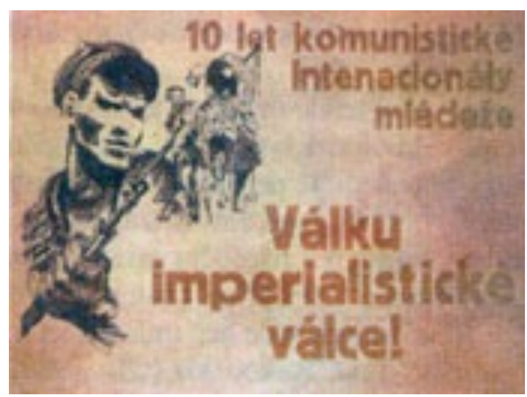
COLD WAR PROPAGANDA November 07, 2019