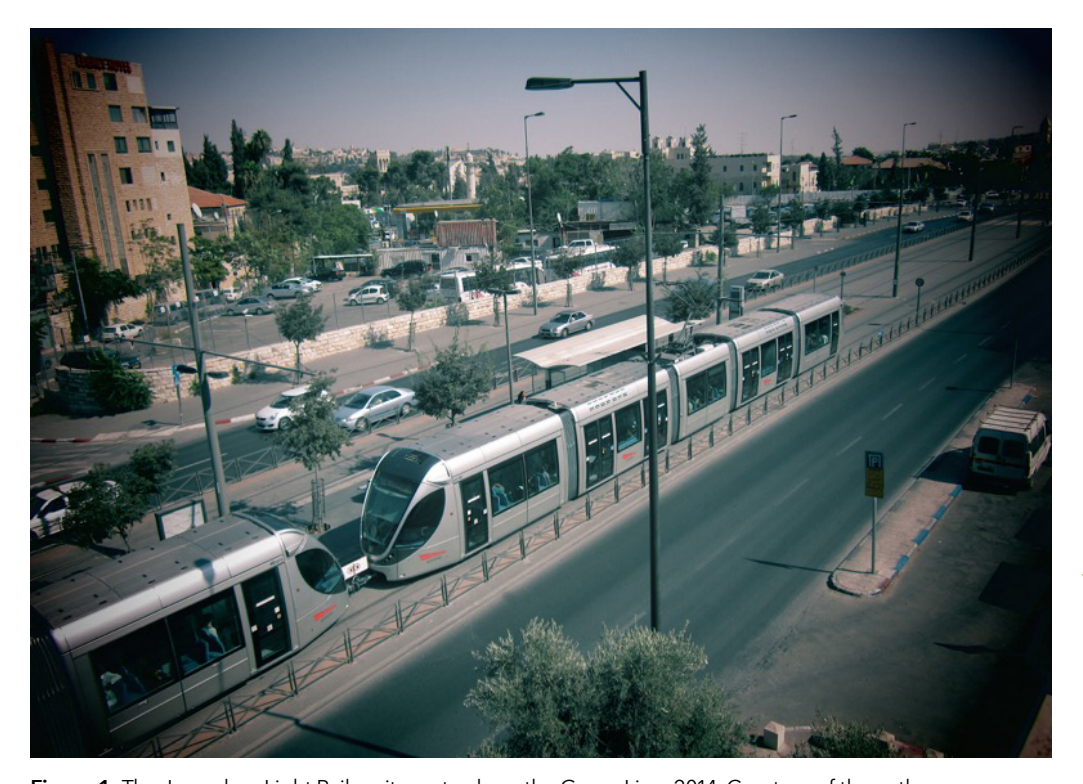
Figure 1: The Jerusalem Light Rail on its route along the Green Line, 2014.

In addition to projecting an image of harmonious shared space, Palestinian usage of the light rail was also aimed at protecting the infrastructure and the Jewish passengers on it, as the former CEO of the light rail operator noted (Interview with Former CEO, CityPass). Here we see how security thinking and normalization are intertwined: rather than exclude dangerous elements, as disciplinary power does, normalization in a security-based system integrates dangerous elements in order