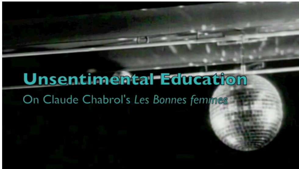
Figure 1: Screenshot from Unsentimental Education (Catherine Grant, 2009)

“[T]here is always a personal edge to the mix of intellectual curiosity and fetishistic fascination.” (Mulvey 2006, 145)