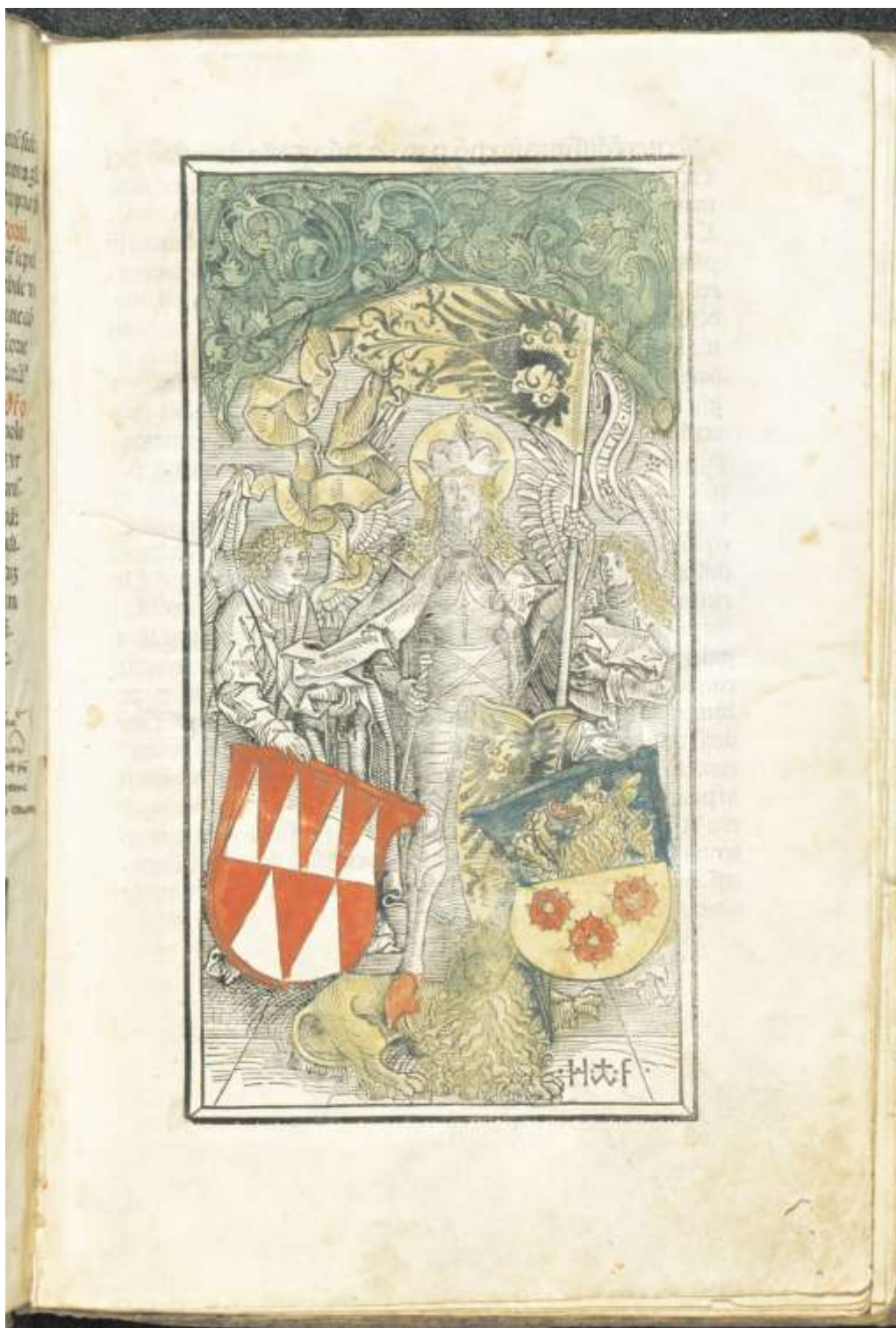
2 Psalterium Olomucense , Brno : Konrad Stahel, 1499 (EK viz heslo Konrad Stahel a popis k obr. č. 190, skripta str. 21)