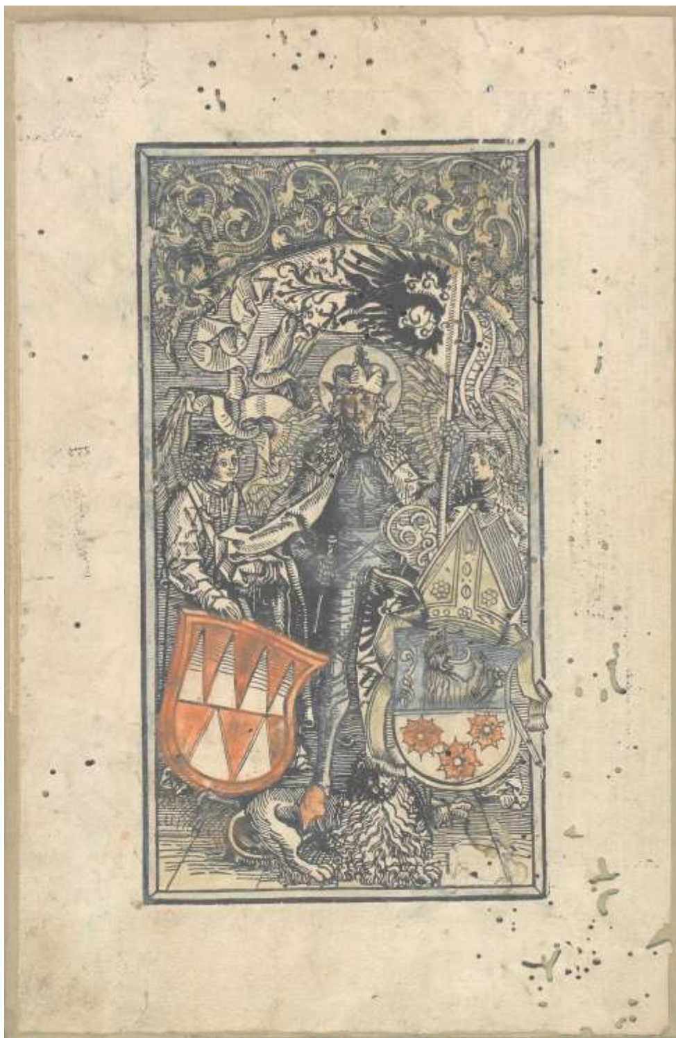
3 Líc a rub odpustkového listu Litterae indulgentiarum , Olomouc : Konrad Baumgarten, 1501 (EK viz heslo Konrad Baumgarten a popis k obr. č. 191, skripta str. 21)