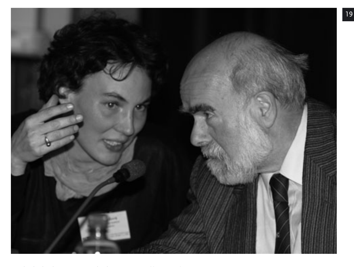
Social and Cultural Diversity in Central and Eastern Europe: Old Factors and New