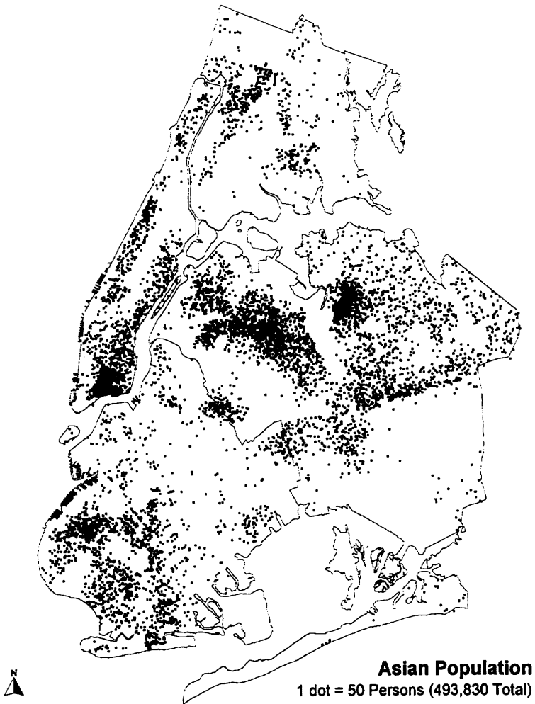
Figure 2: New York City Residential Patterns: Asian Population