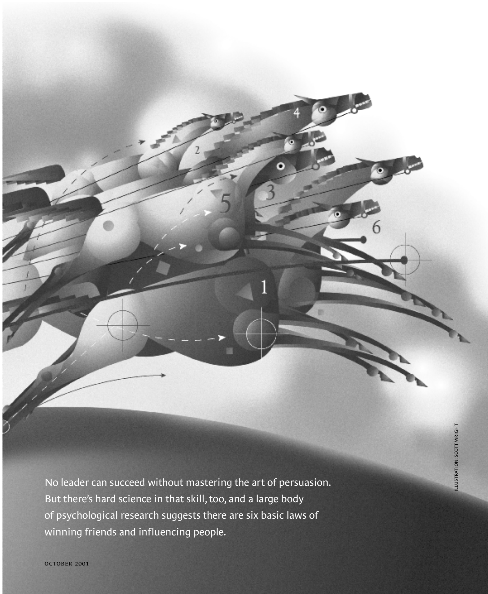
ILLUSTRATION: SCOTT WRIGHT

No leader can succeed without mastering the art of persuasion. But there's hard science in that skill, too, and a large body of psychological research suggests there are six basic laws of winning friends and influencing people.